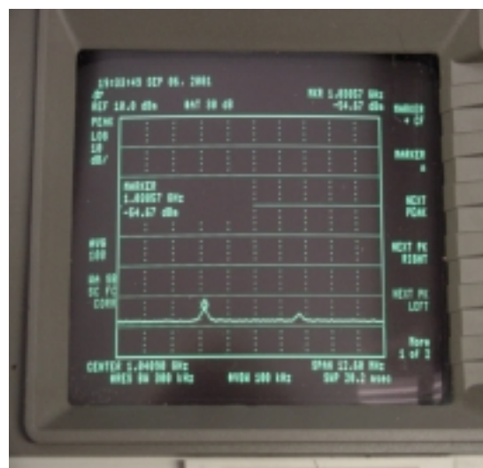
Adjacent channel spurious Output @ 250 watts peak