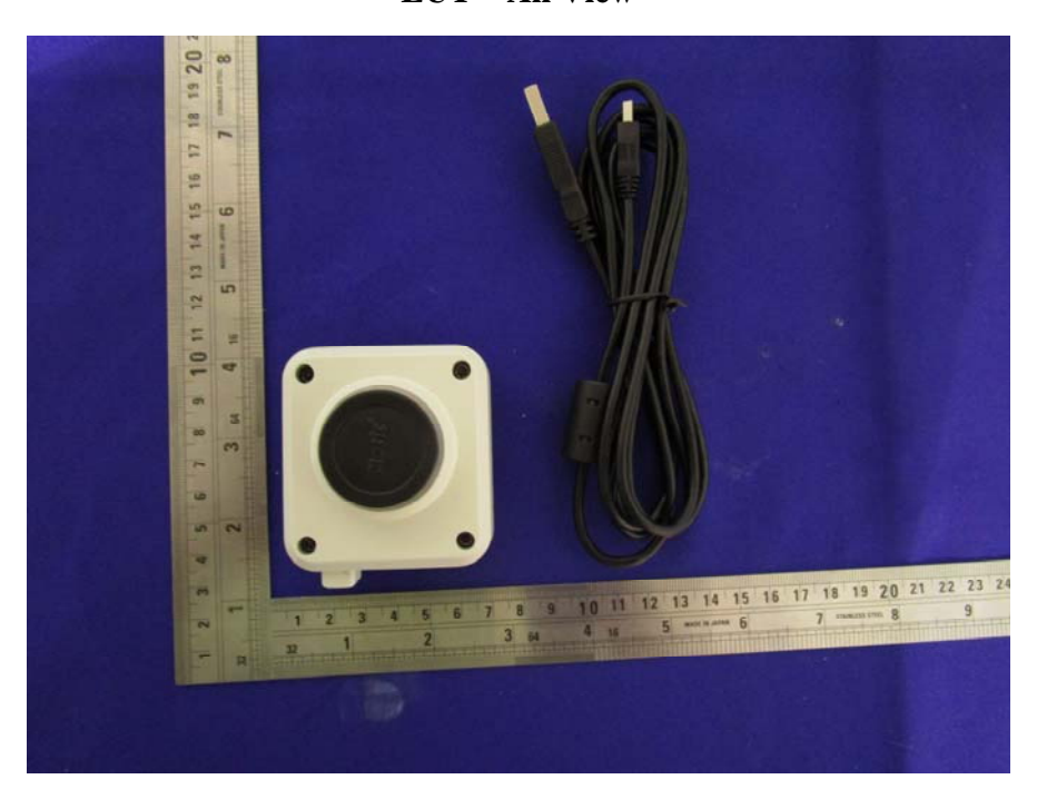
EUT -Top View