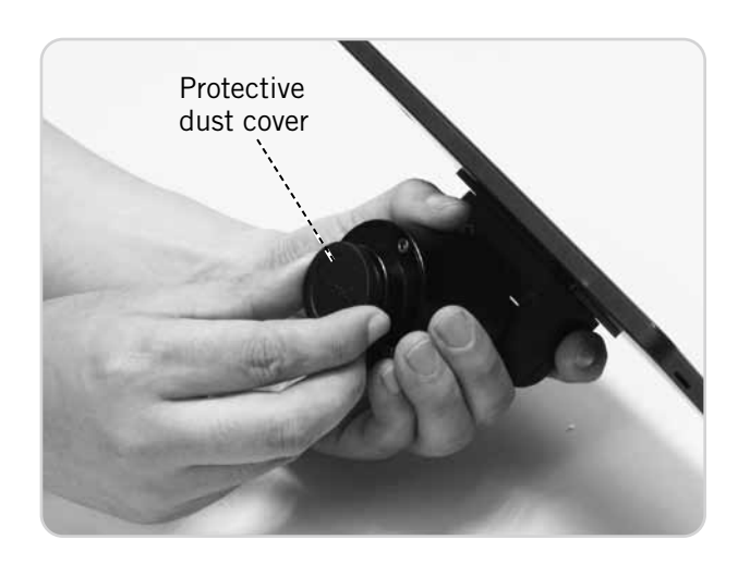
Step 1: Unscrew the protective dust cover from the bottom of the Moticam S2 to expose the imaging sensor to light.

Please note that the Moticam S2 is a C-mount camera, therefore you must have a trinocular microscope with a relevant C-Mount adapter between 0.5X and 0.65X magnification.