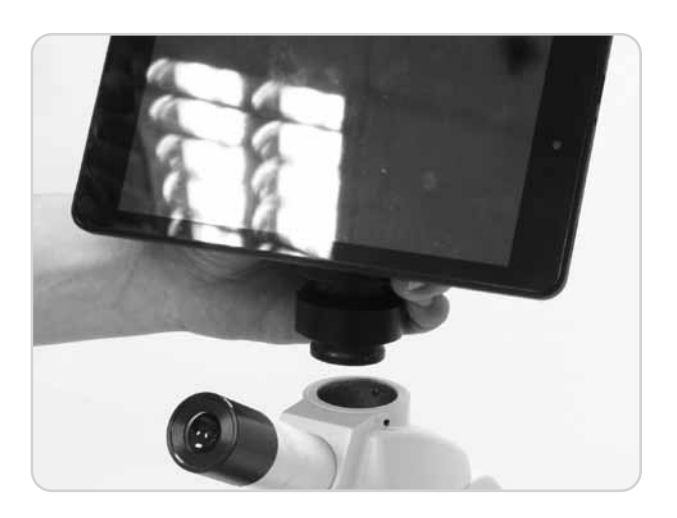
Step 2: Mount the Moticam S2 onto your microscope's C-mount, and if your microscope is equipped with a beam splitter, pull the beam splitter to ensure light can reach to the trinocular port.