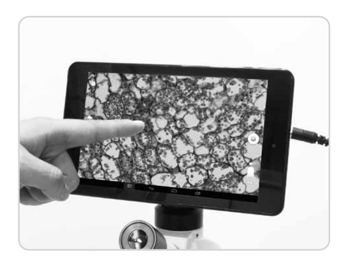
Step 6: Using the MotiConnect T is easy, an onscreen guide can be activated by pressing the question mark at any stage. This will allow you to tap an icon and examine its function.