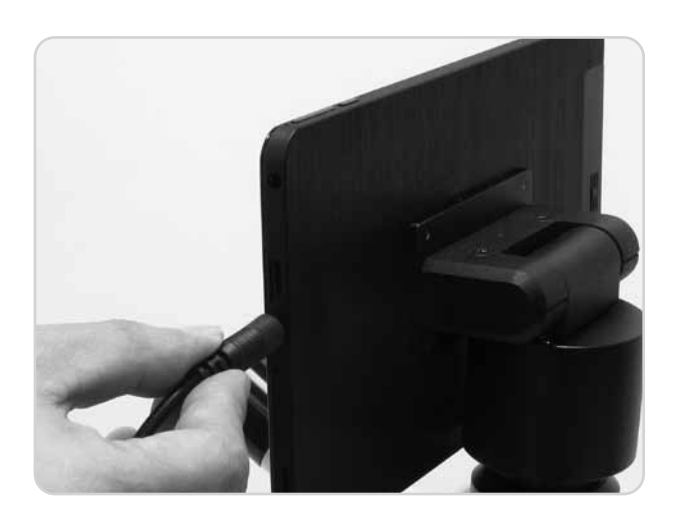
Step 3: Plug in the Moticam S2 power supply and press the power button to start.