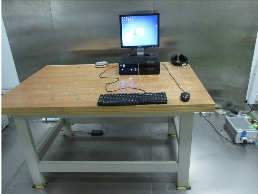
Conduction Emissions - Side View