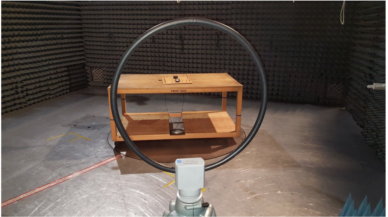
Photo 1: Test setup for radiated measurements below 30 MHz, front side view