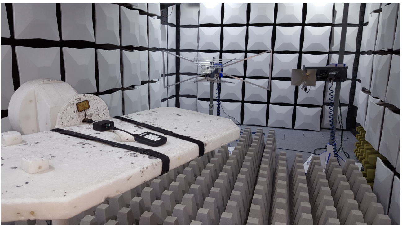
Photo 4: Test setup for radiated measurements in fully-anechoic chamber above 1 GHz