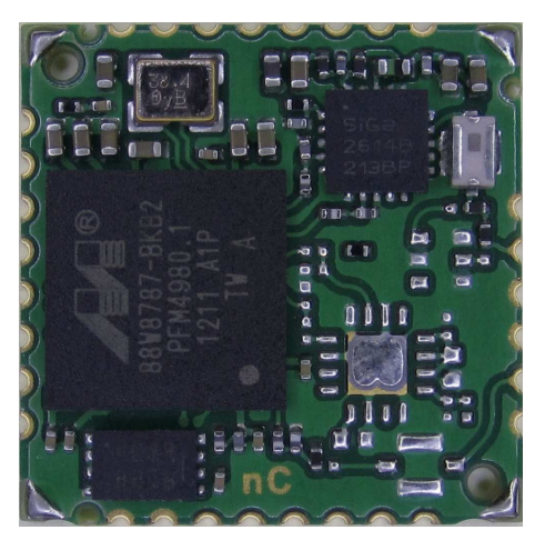
Figure 1: ELLA-W131 top view internal photo