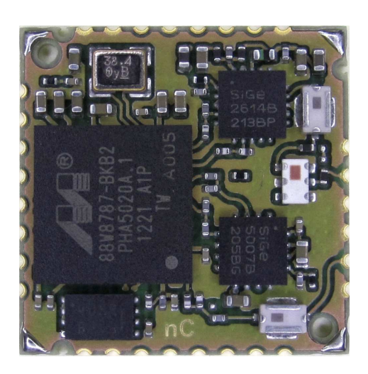
Figure 4: ELLA-W163 top view internal photo