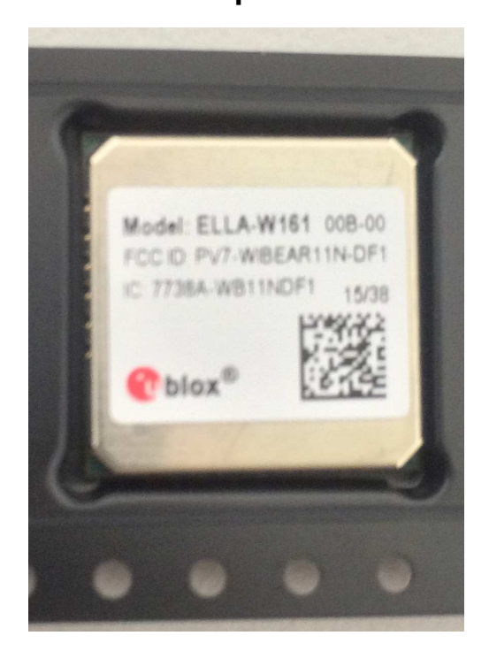
Figure 5: ELLA-W161 in tape&reel packaging

The shielded ELLA-W1 series modules differ only in the information shown on the product label, i.e. model name and corresponding FCC and IC IDs as listed in Table 1. Figure 5 shows the external photo for ELLA-W161.