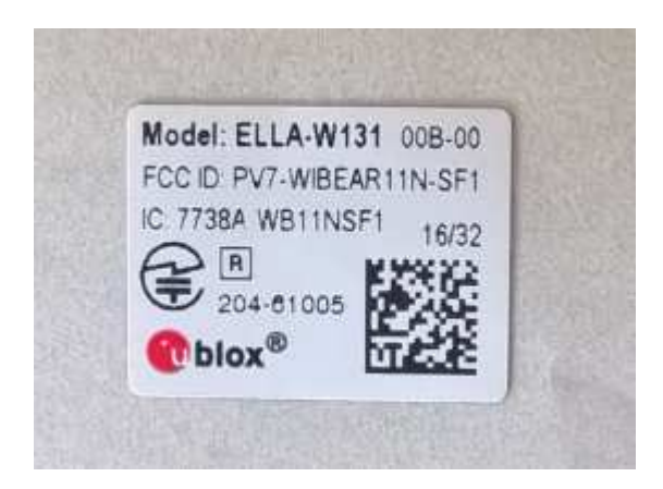
Figure 6: ELLA-W131 label photo