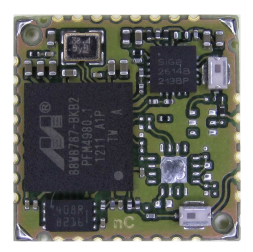
Figure 2: ELLA-W133 top view internal photo