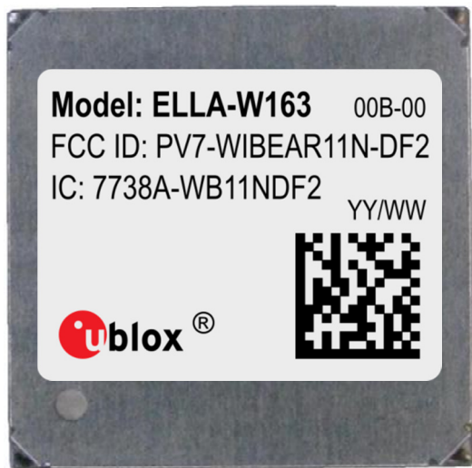
Figure-3 Label location of identifier label for PMN: ELLA-W163-00B.

The FCC/IC label is affixed on the shield cover as shown in Figure-3. The label size is 13.0 x 10.0 mm.