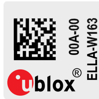
Figure-2 PMN: ELLA-W163-00A FCC/IC identifier label.

The modules of the ELLA-W1 product family are SMT components typically processed in large volumes and mounted onto the host board by automatic "pick&place" machines.