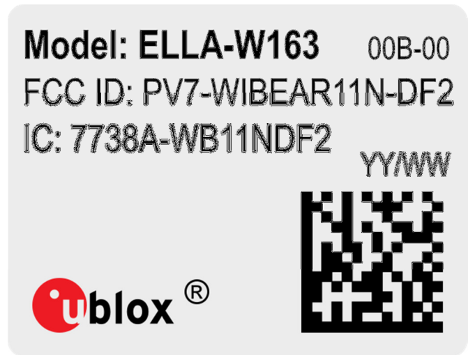
Figure-4 PMN: ELLA-W163-00B FCC/IC identifier label.

Instructions on how to attach an auxiliary label in compliance with the modular approval guidelines developed by the FCC 100 will be provided in the module data sheet.