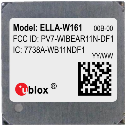
Figure-3 Label location of identifier label for PMN: ELLA-W161-00B.

The FCC/IC label is affixed on the shield cover as shown in Figure-3. The label size is 13.0 x 10.0 mm.