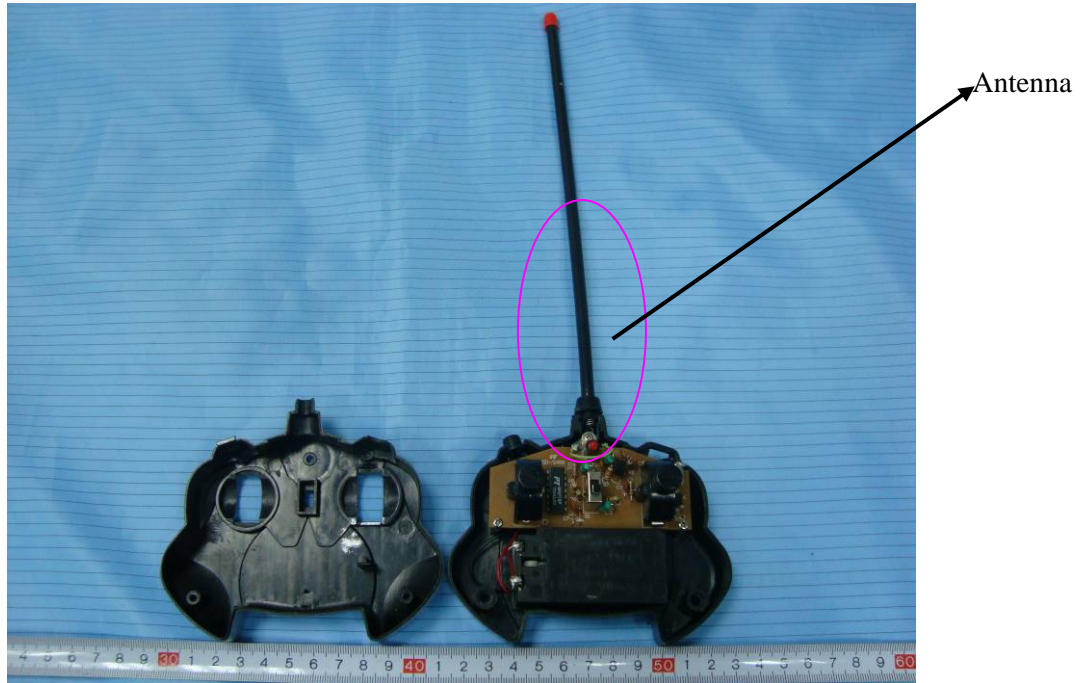
EUT – Main Board Components View