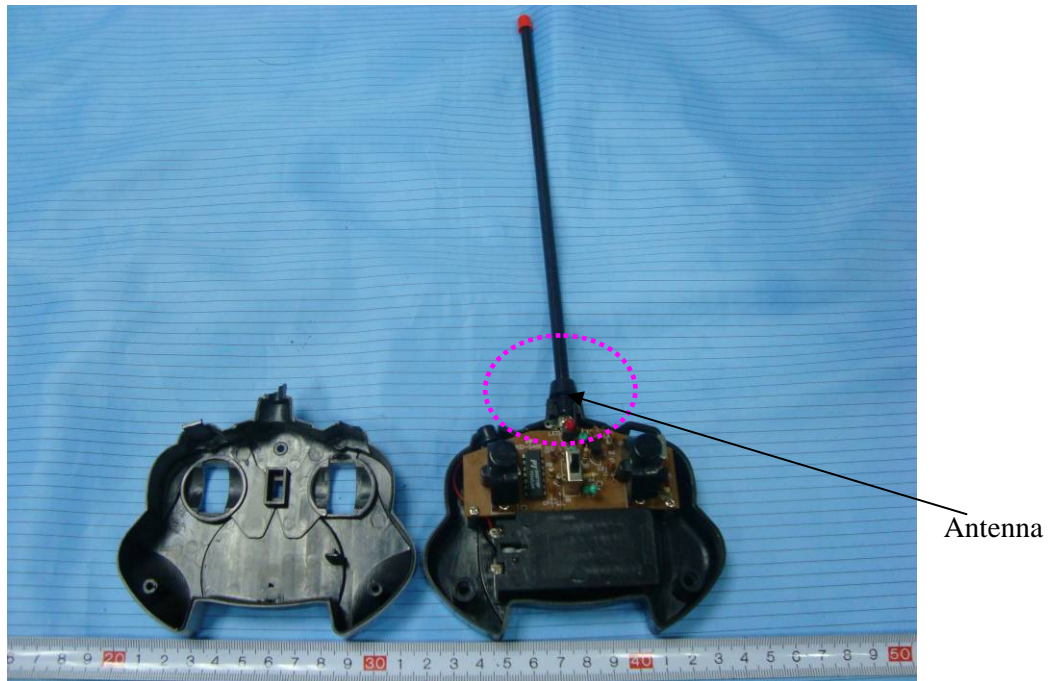
EUT – Main Board Components View