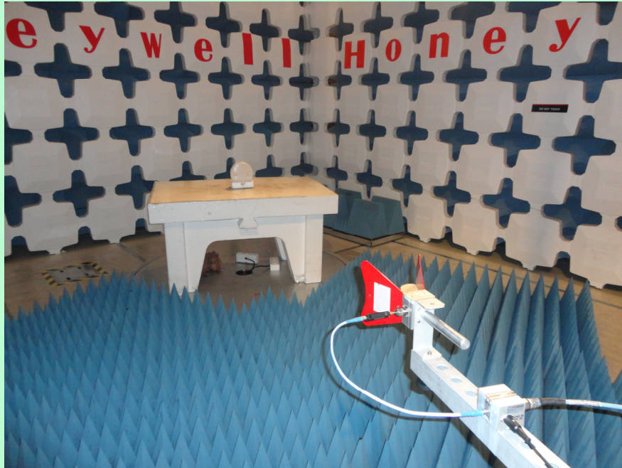
Radiated Emission Setup – 1 GHz to 10 GHz [ Horizontal Polarization ]