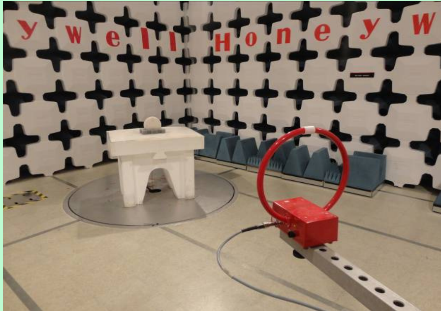
Radiated Emission Setup – 9 KHz to 30 MHz [ Parallel ]