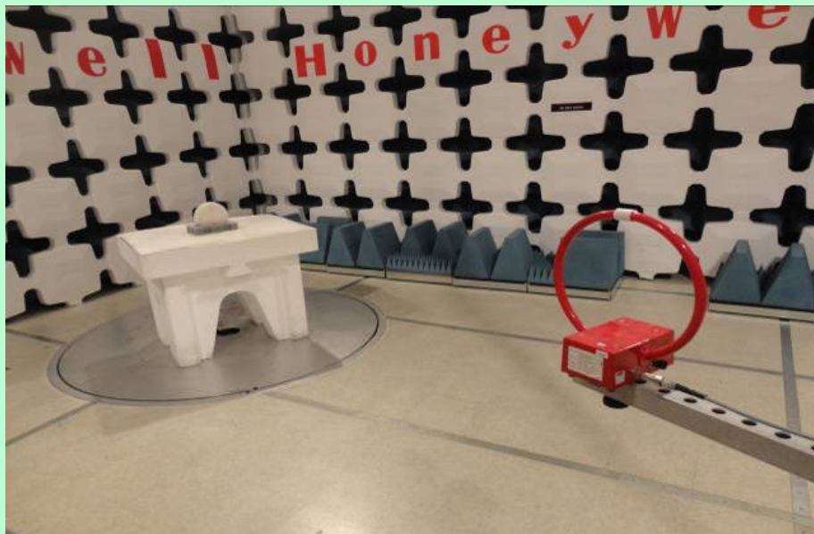
Radiated Emission Setup – 9 KHz to 30 MHz [ Perpendicular ]