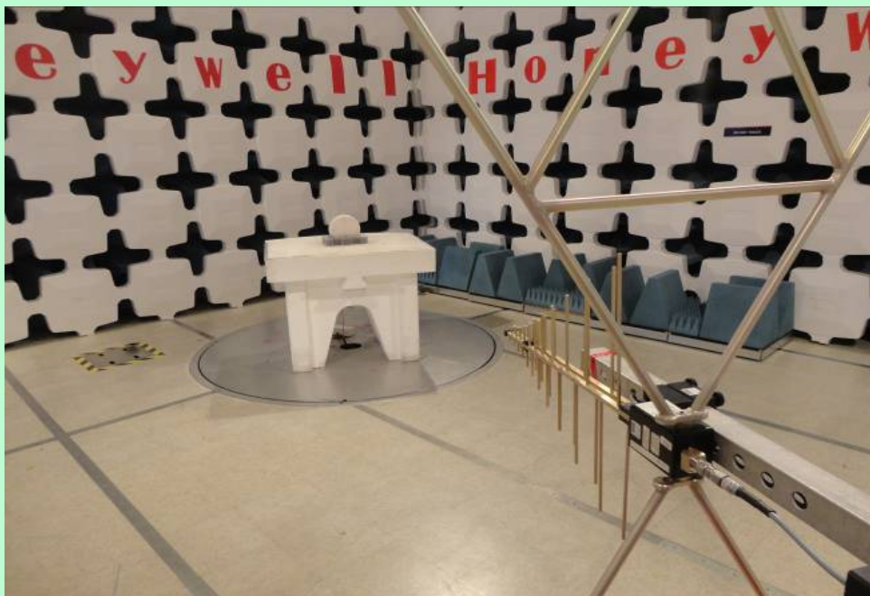
Radiated Emission Setup – 30 MHz to 1 GHz [ Perpendicular Polarization ]