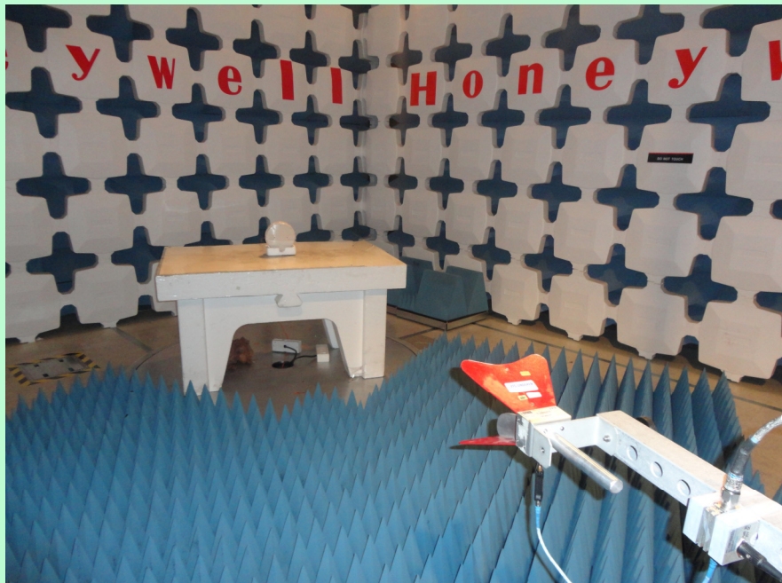
Radiated Emission Setup – 1 GHz to 10 GHz [ Perpendicular Polarization ]