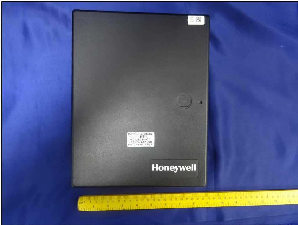
EUT Dimensional view