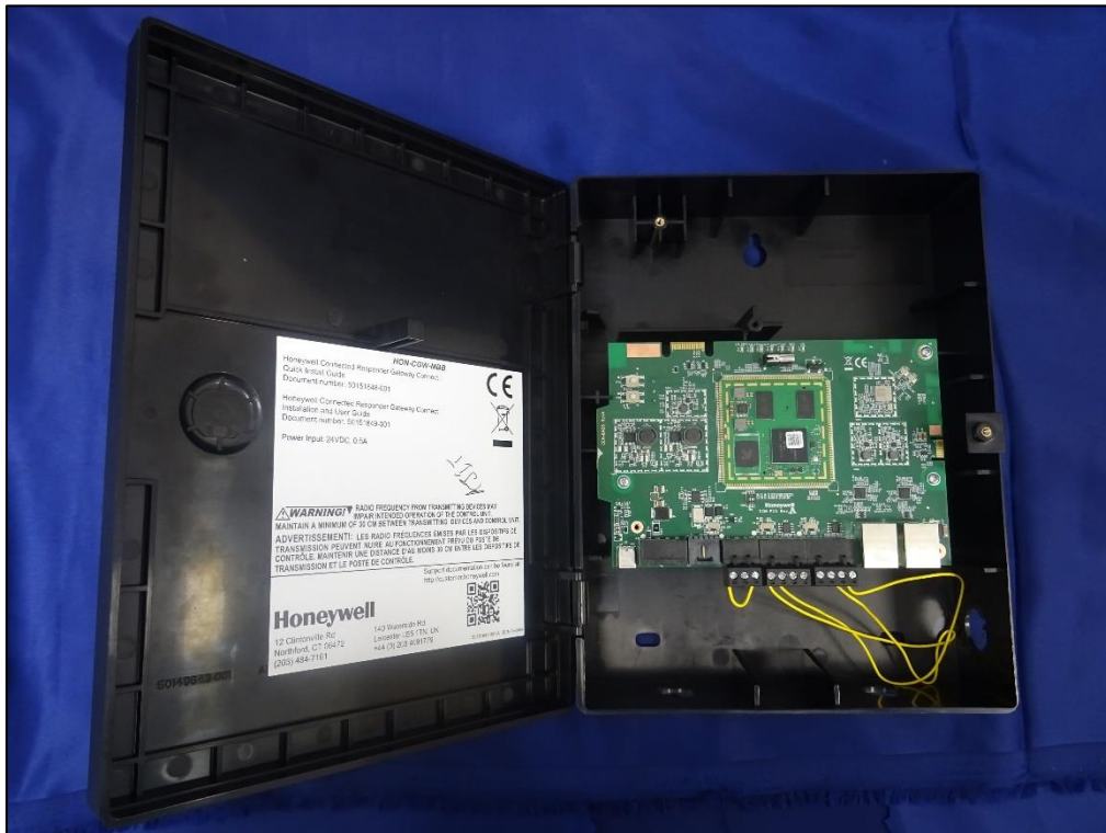
EUT Enclosure Opened