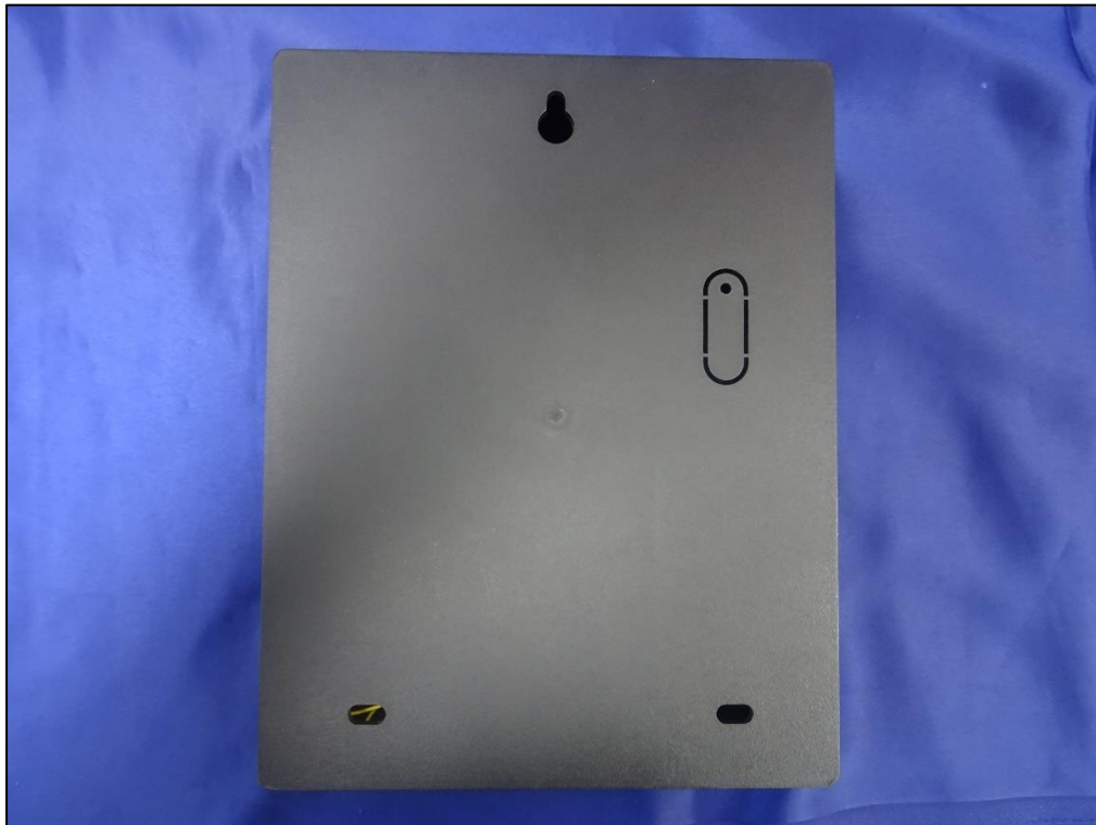
EUT Rear View