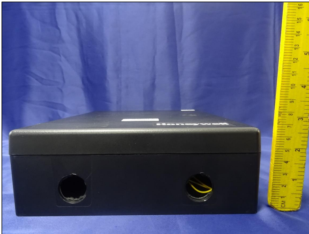
EUT Dimensional view