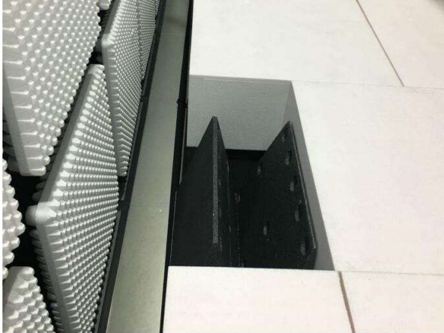
Radiated spurious emission Test Setup-3(Above 1GHz) There are absorbing materials under the ground.