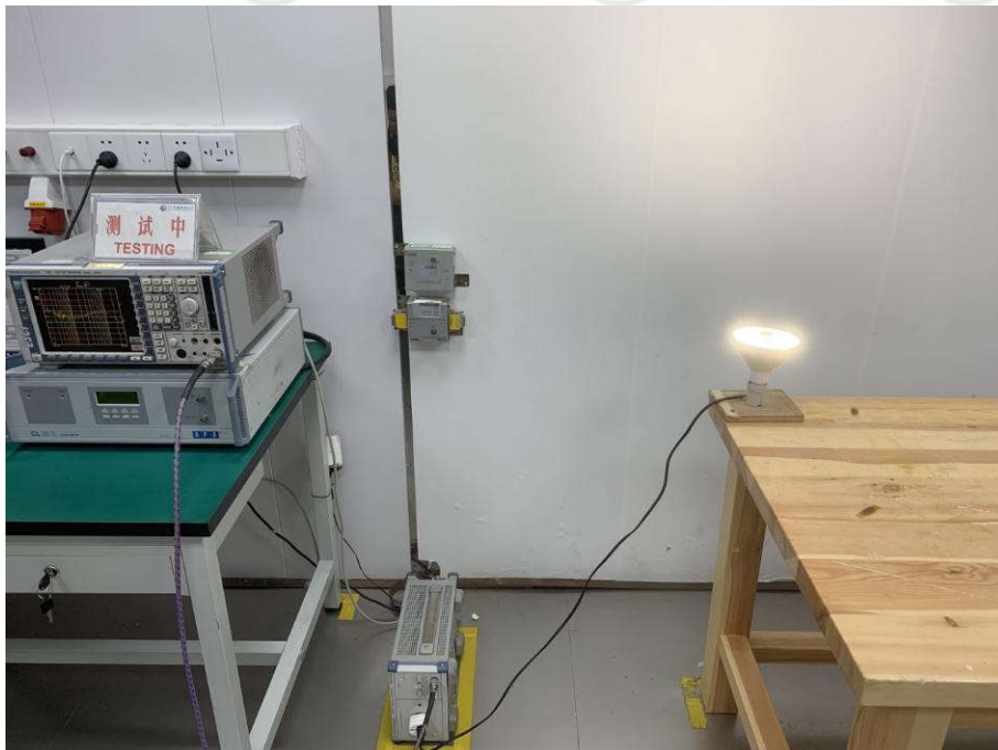
AC Power Line Conducted Emission