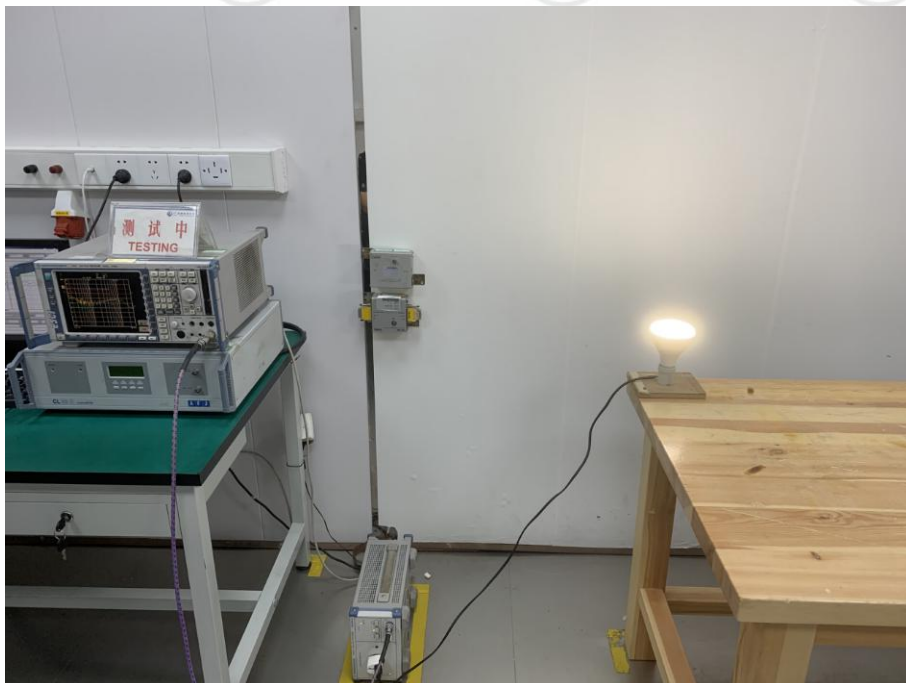
AC Power Line Conducted Emission