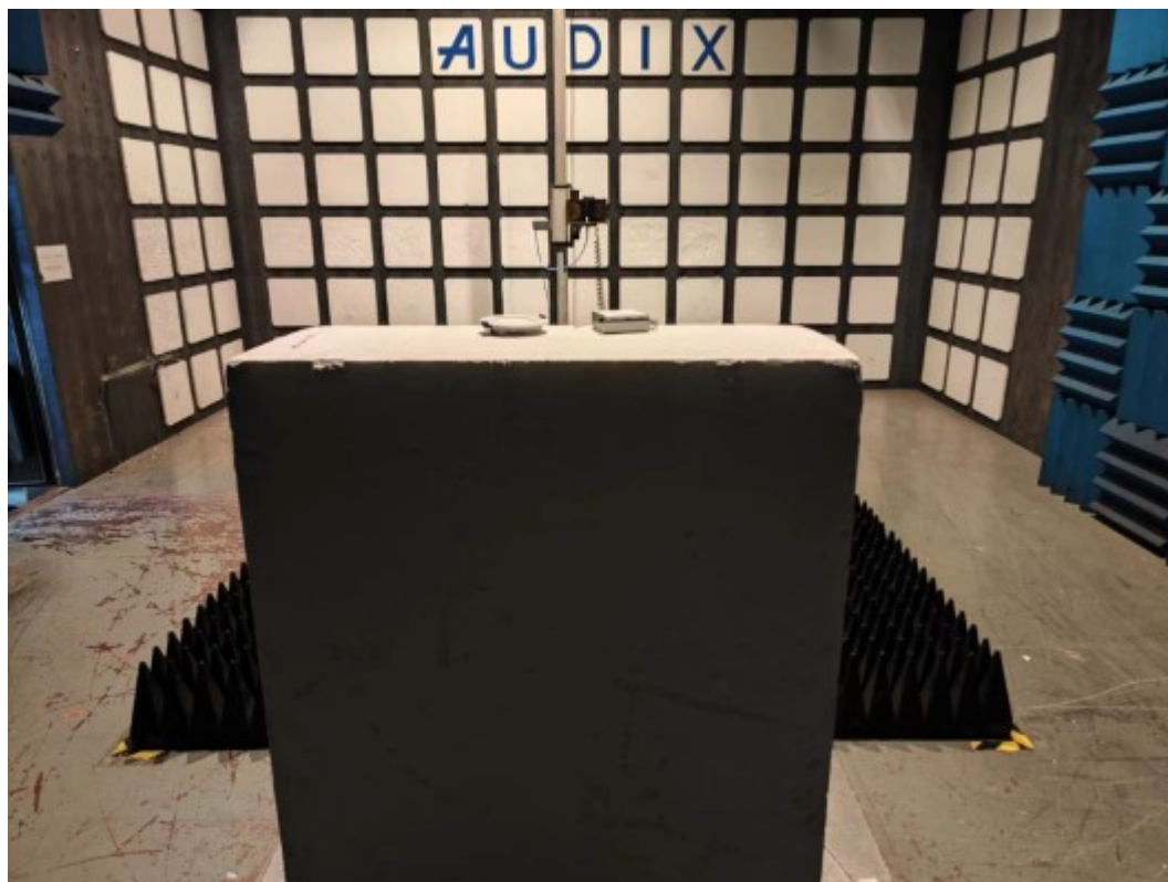
(ABOVE 1GHZ) FRONT