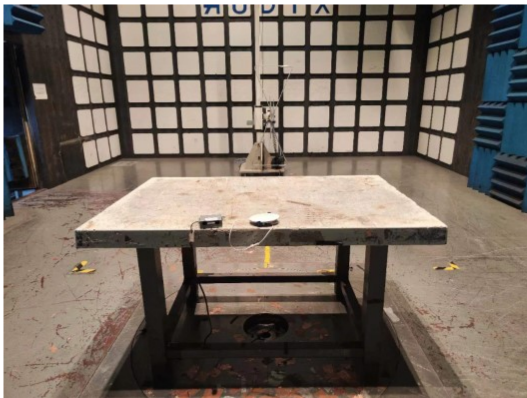
(BELOW 1GHZ) BACK