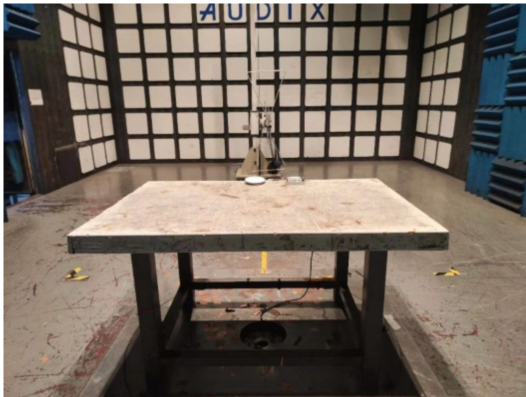
(BELOW 1GHZ) FRONT