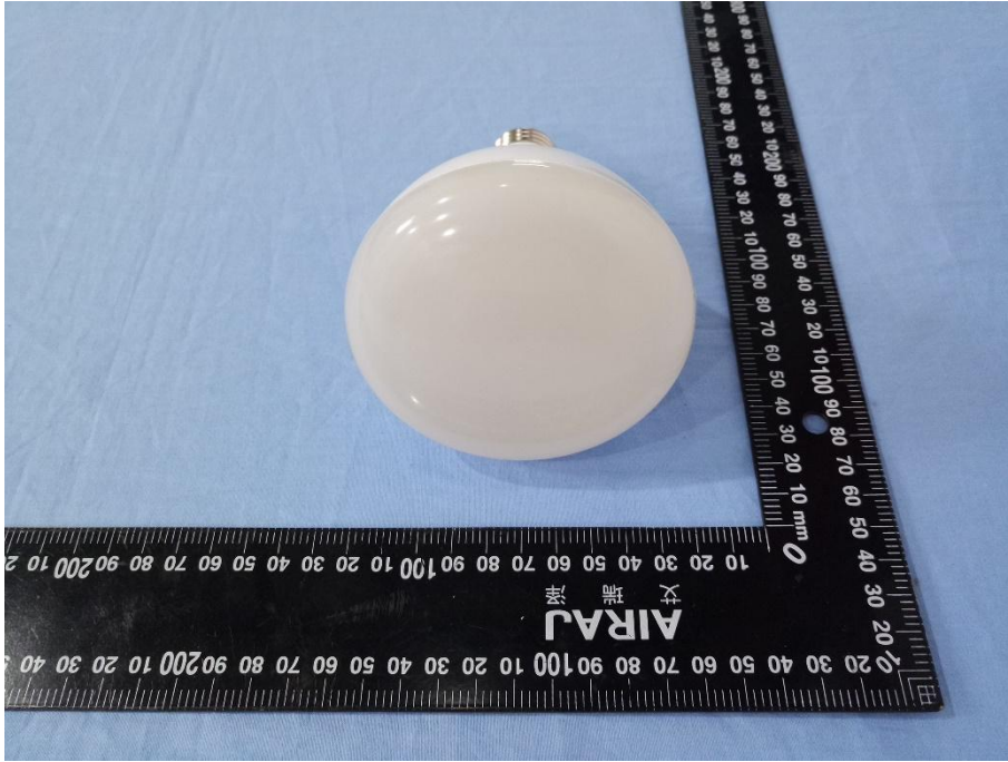
Lamp top side view

NOTE: 1.The report is invalid when there is no the approver signature and the special stamp for test report. 2.The test report shall not be reproduced except in full without prior written permission of the company. 3.The report copy is invalid when there is no the special stamp for test report. 4.The altered report is invalid. 5.The entrust test is responsibility for the received sample only.