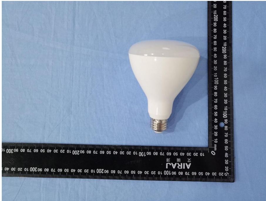
Lamp front view