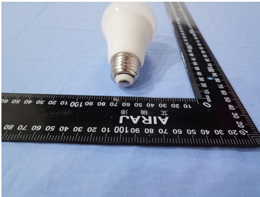
EUT bottom view

NOTE: 1.The report is invalid when there is no the approver signature and the special stamp for test report. 2.The test report shall not be reproduced except in full without prior written permission of the company. 3.The report copy is invalid when there is no the special stamp for test report. 4.The altered report is invalid. 5.The entrust test is responsibility for the received sample only.