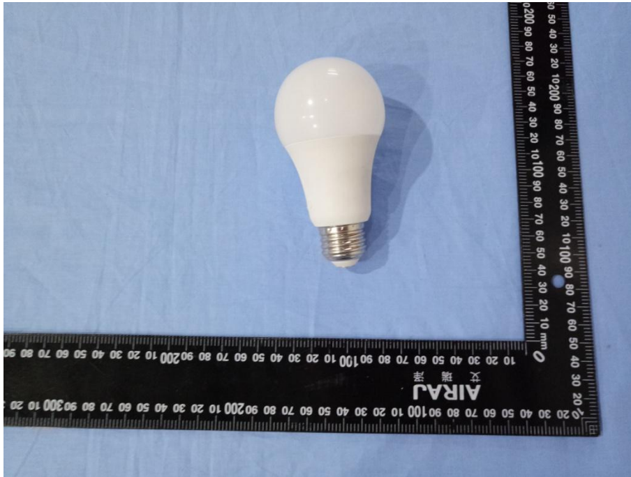
EUT front view