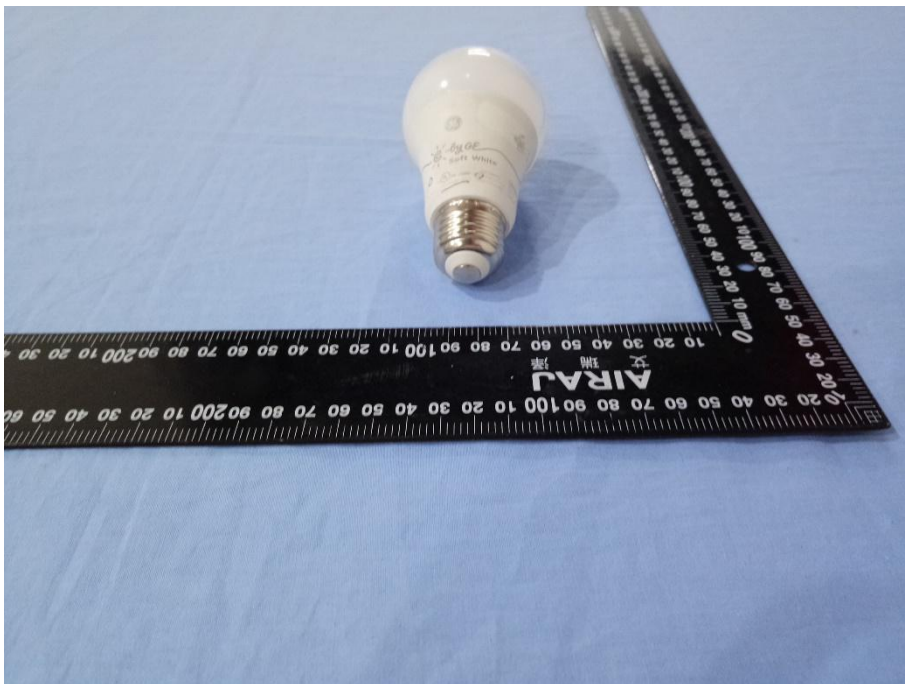
EUT bottom view

NOTE: 1.The report is invalid when there is no the approver signature and the special stamp for test report. 2.The test report shall not be reproduced except in full without prior written permission of the company. 3.The report copy is invalid when there is no the special stamp for test report. 4.The altered report is invalid. 5.The entrust test is responsibility for the received sample only.