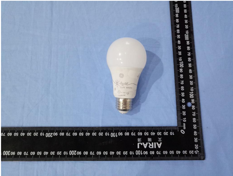
EUT front view