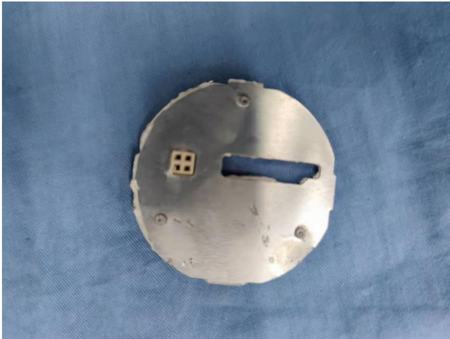
7. light source bottom view