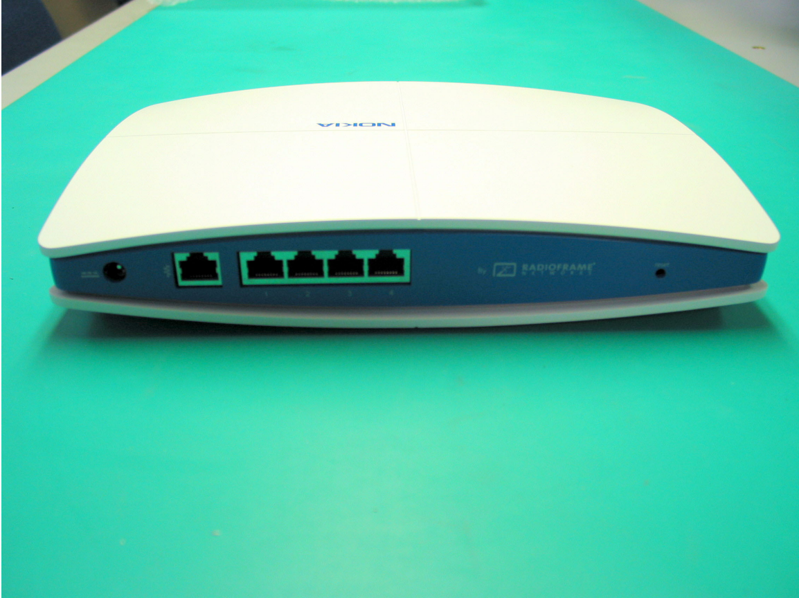
S-1 Chassis rear