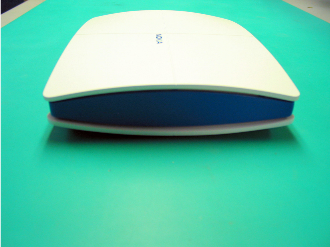
S-1 Chassis right side