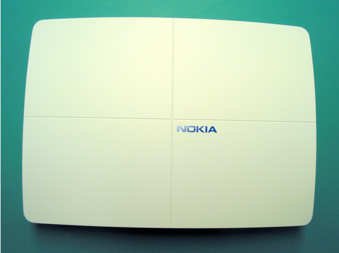
S-1 Chassis top