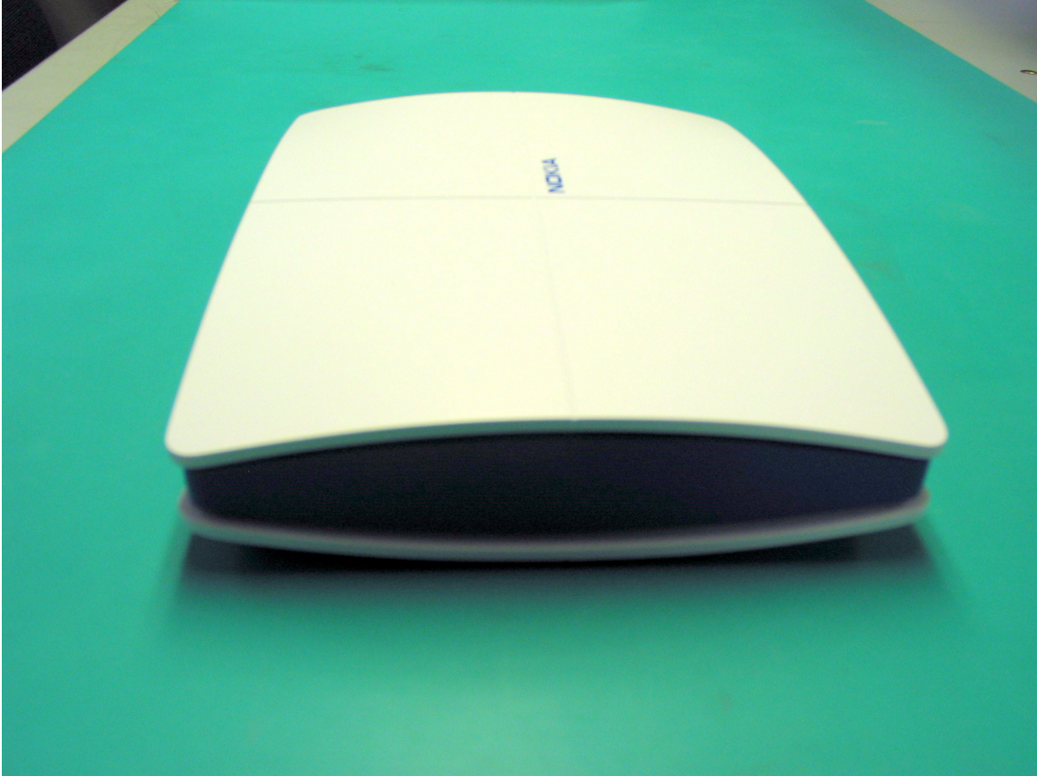
S-1 Chassis left side