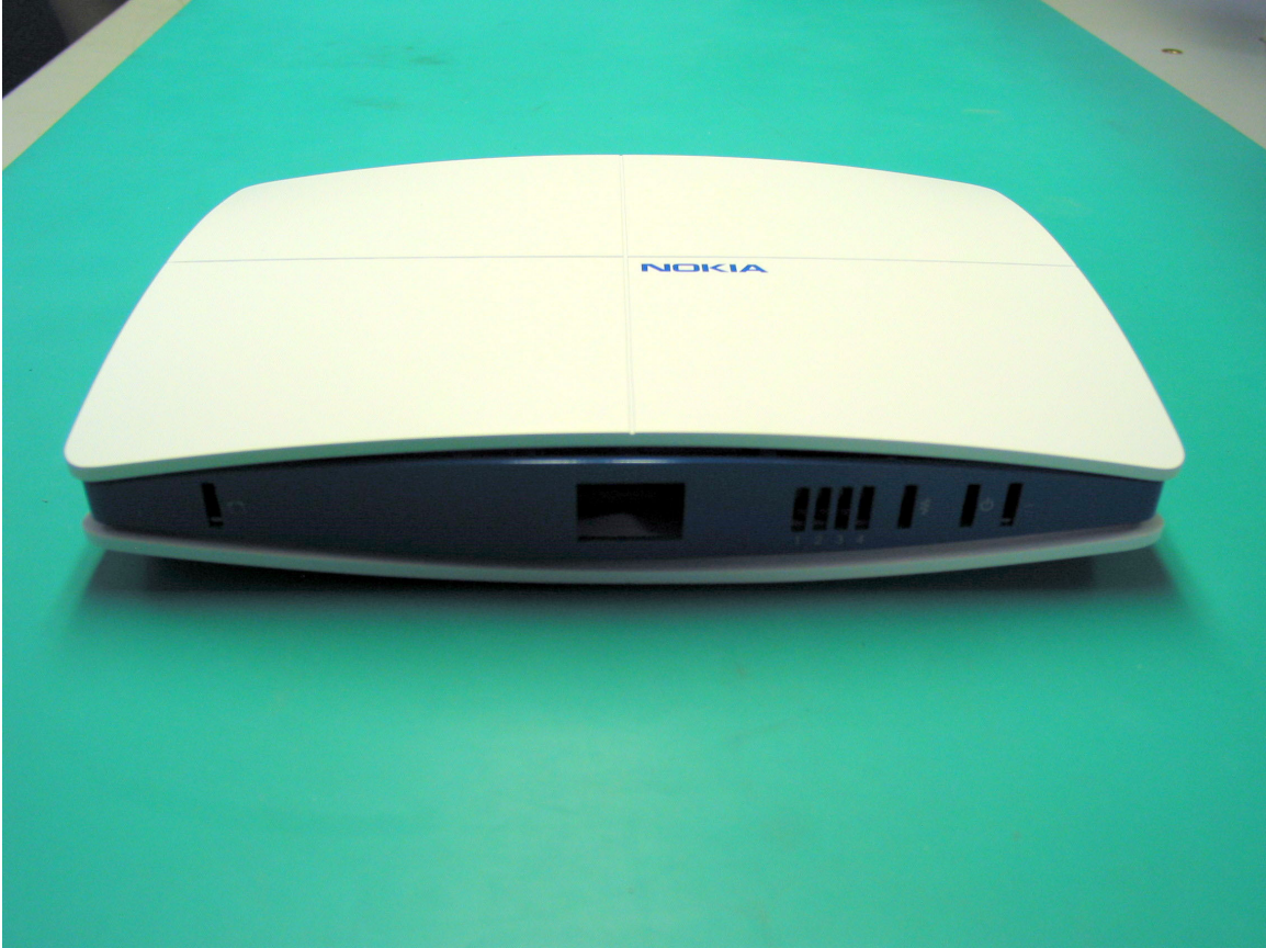
S-1 Chassis front