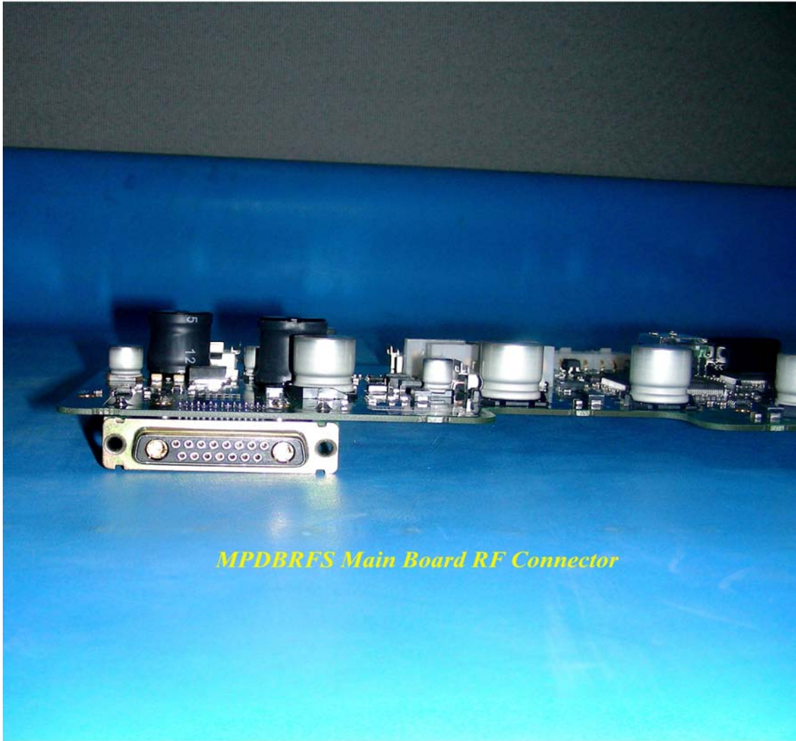
MPDBRFS Main Board RF Connector