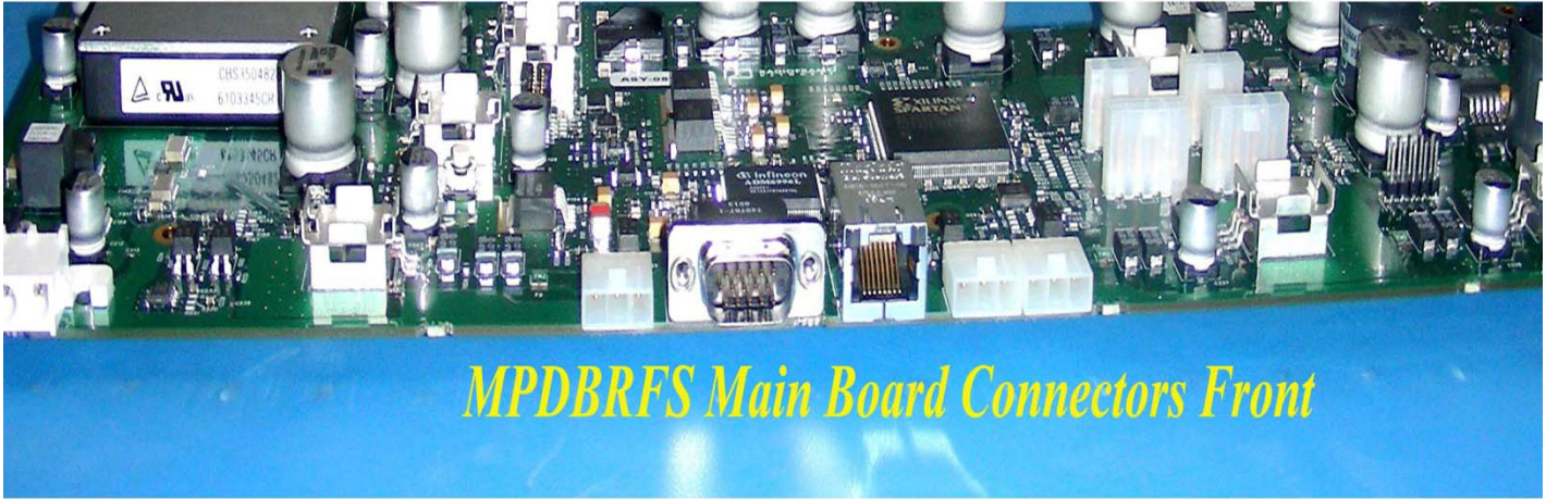
PCB Front Connectors