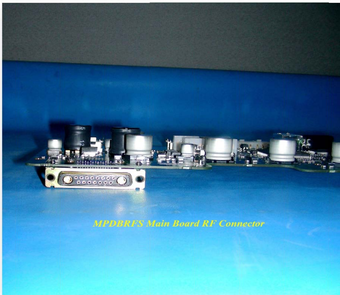
PCB RF Connector