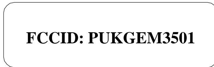
Figure E7.1 Core Engine Regulatory / FCC label.

As required by § 2.1033(c)(11), this exhibit details the FCC Identifier label and its placement on the Core Engine GSM Radio Module. A drawing representative of the actual FCC Identifier label is shown in Figure E7.1; the label itself will be permanently affixed to the Core Engine as shown in the photo presented as Figure E7.2.