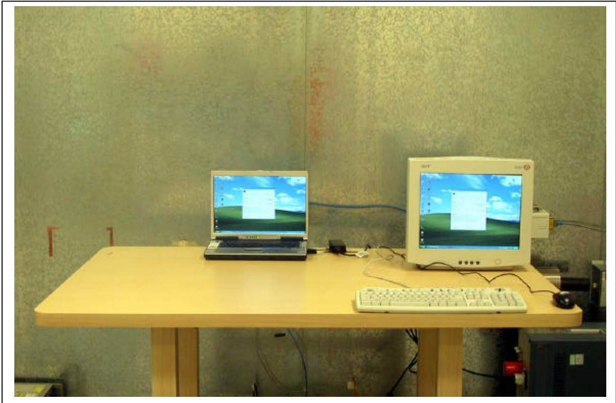
The Front View of Highest Conducted Set-up For EUT