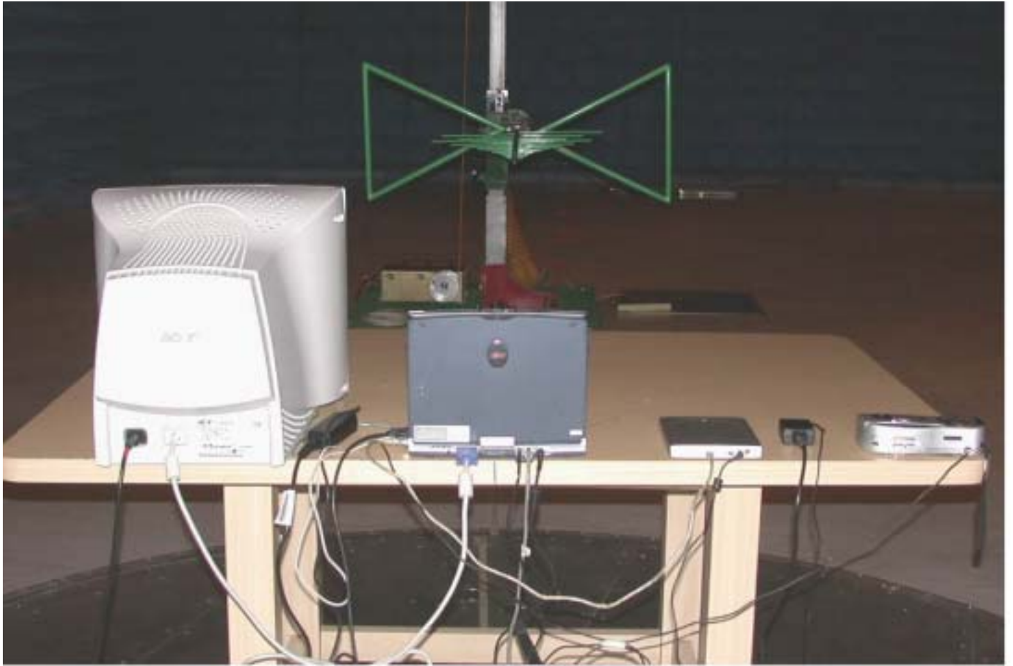
Radiated emissions 2