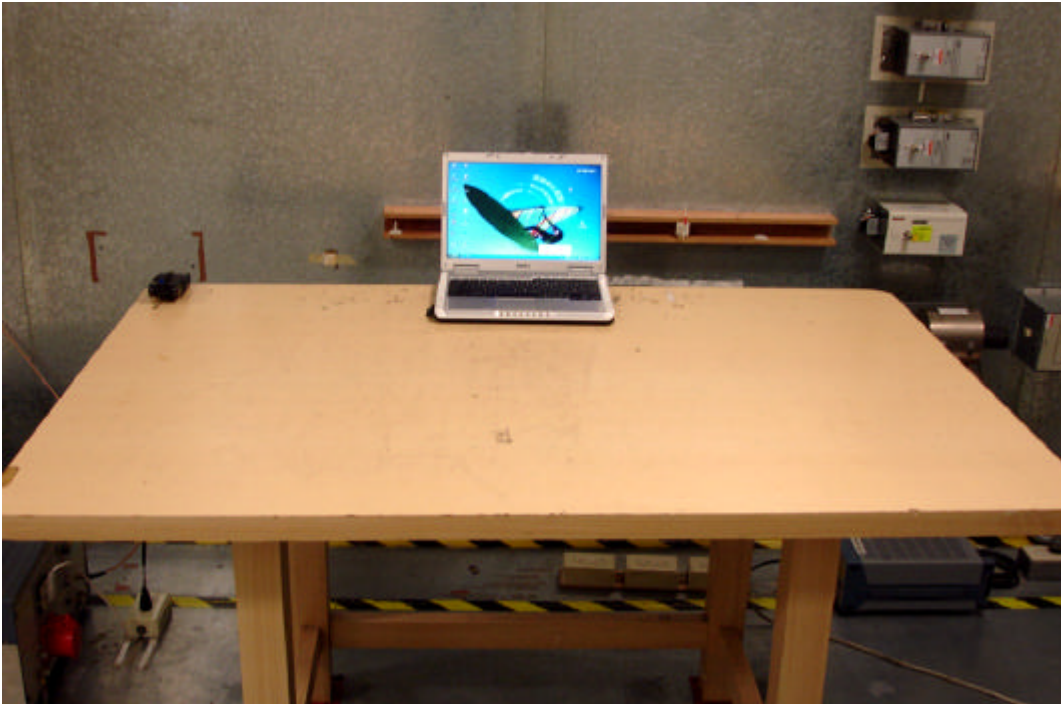
The Front View of Highest Conducted Set-up For EUT