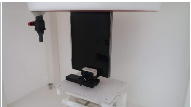
Edge 4, Test Separation 0 mm