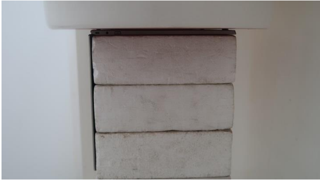
Bottom of Laptop, Test Separation 0 mm