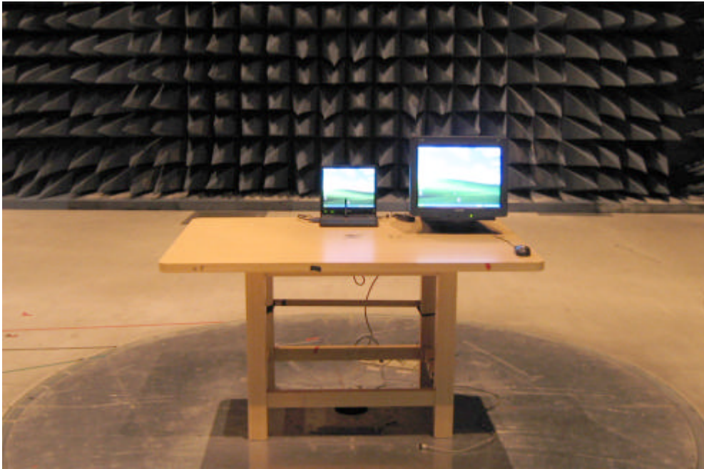
The Back View of Highest Radiated Set-up For EUT