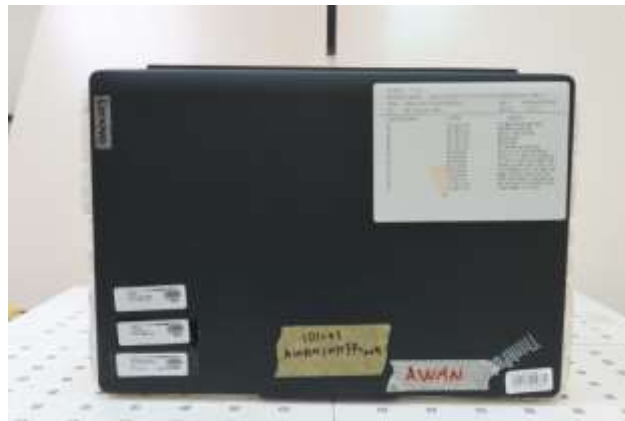
Bottom of Laptop at 2 mm