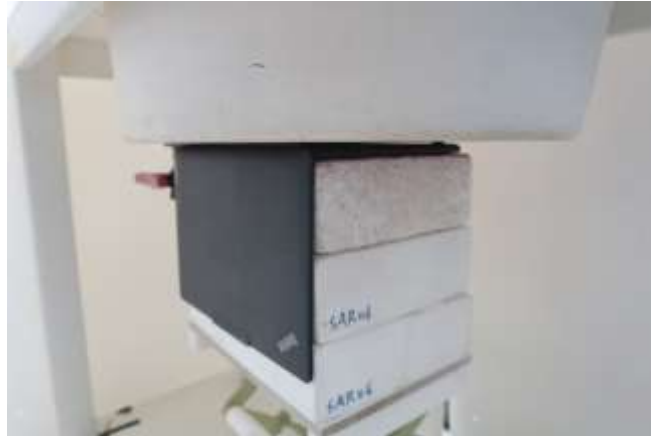
Bottom of Laptop at 0 mm