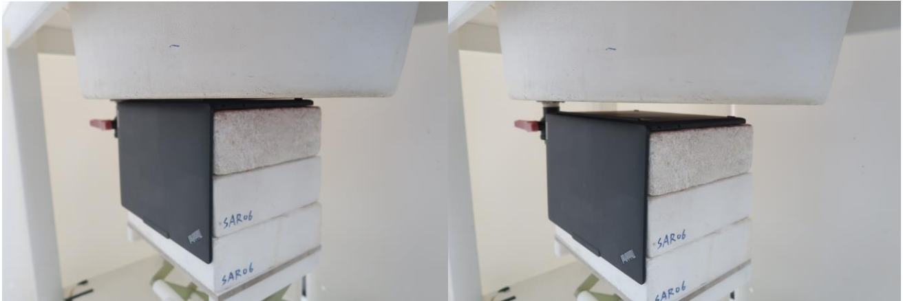
Bottom of Laptop at 0 mm