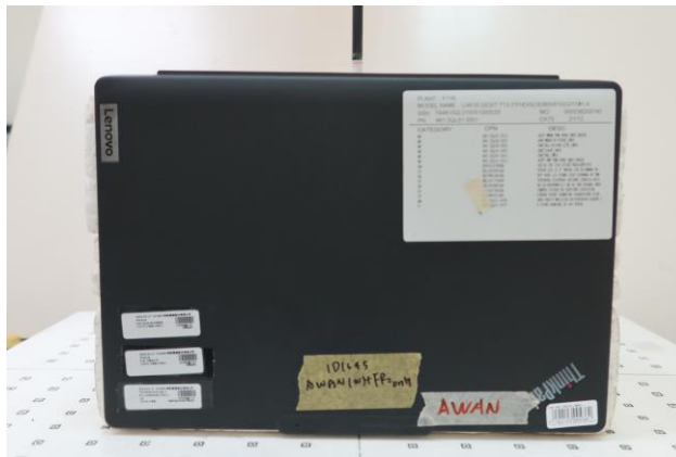
Bottom of Laptop at 2 mm