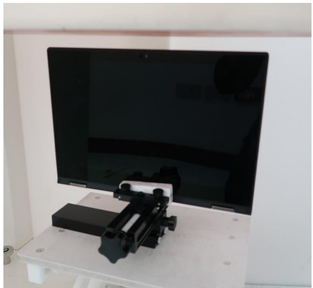
Edge1, Test Separation 16 mm