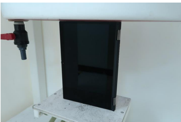
Edge2, Test Separation 0 mm