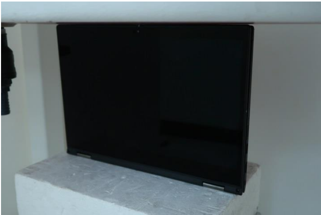
Edge1, Test Separation 0 mm