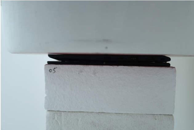
Bottom Face, Test Separation 0 mm