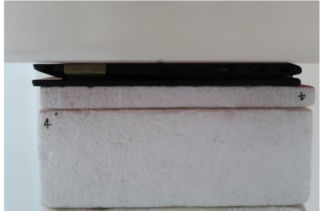
Bottom Face, Test Separation 1 mm