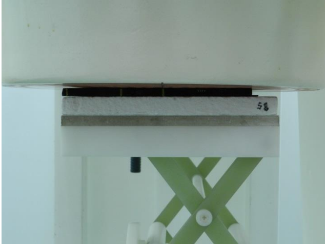
Bottom Face, Test Separation 0 mm