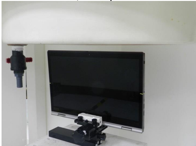
Edge1, Test Separation 18 mm