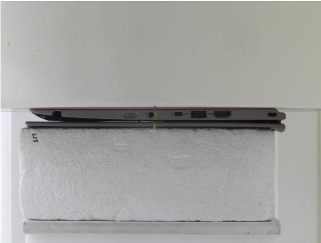
Bottom Face, Test Separation 0 mm