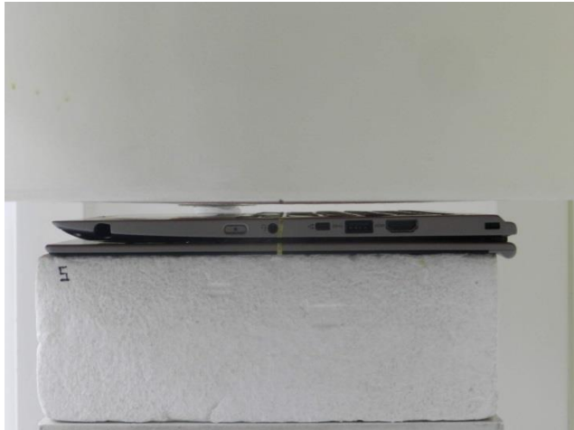
Bottom Face, Test Separation 10 mm