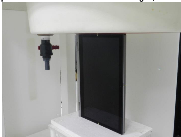
Edge4, Test Separation 0 mm