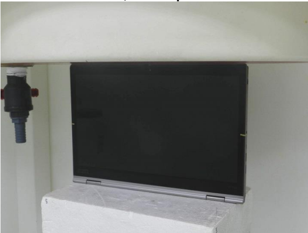
Edge1, Test Separation 0 mm