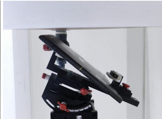
Curved surface of Edge1, Test Separation 0 cm