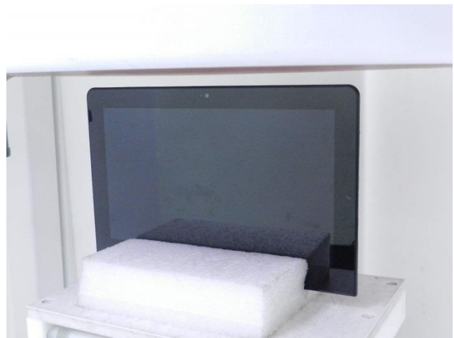
Edge1, Test Separation 1.0 cm