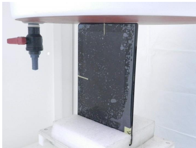
Edge2, Test Separation 0 cm