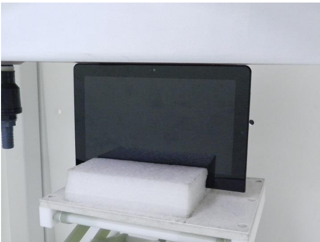
Edge1, Test Separation 0 cm