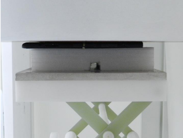
Bottom Face, Test Separation 0 cm