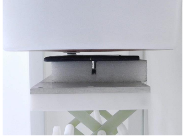
Bottom Face, Test Separation 1.0 cm