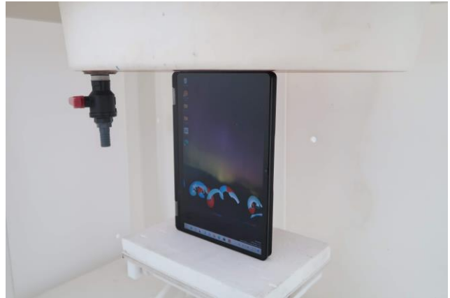
Edge4 at 0 mm