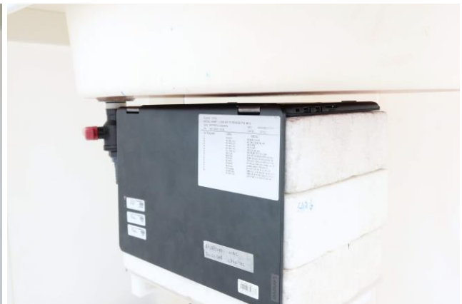
Bottom of Laptop at 11 mm