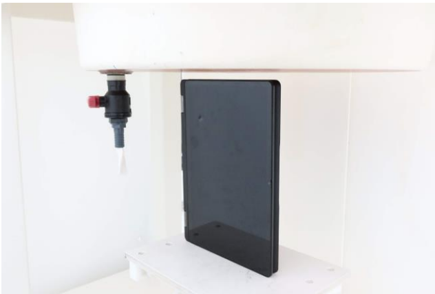
Edge4 at 10 mm