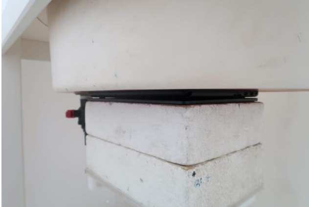
Bottom Face at 0 mm