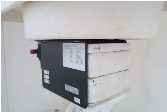
Bottom of Laptop at 0 mm