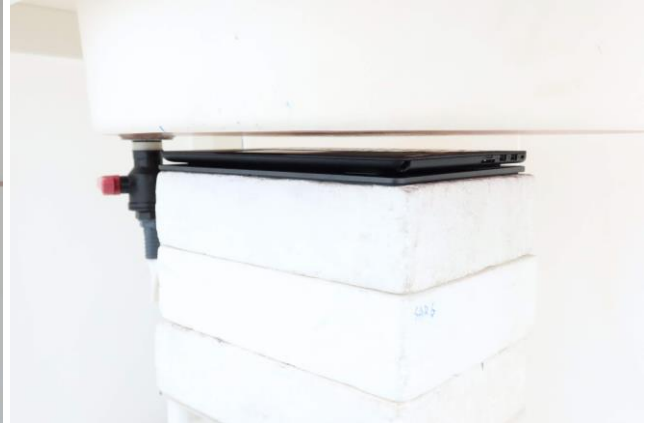
Bottom Face at 14 mm