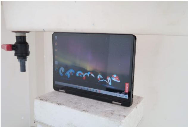
Edge1 at 0 mm