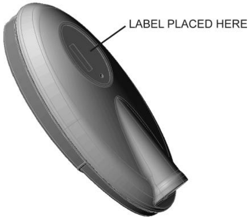
FreePad Model RFMT-1 Label Location