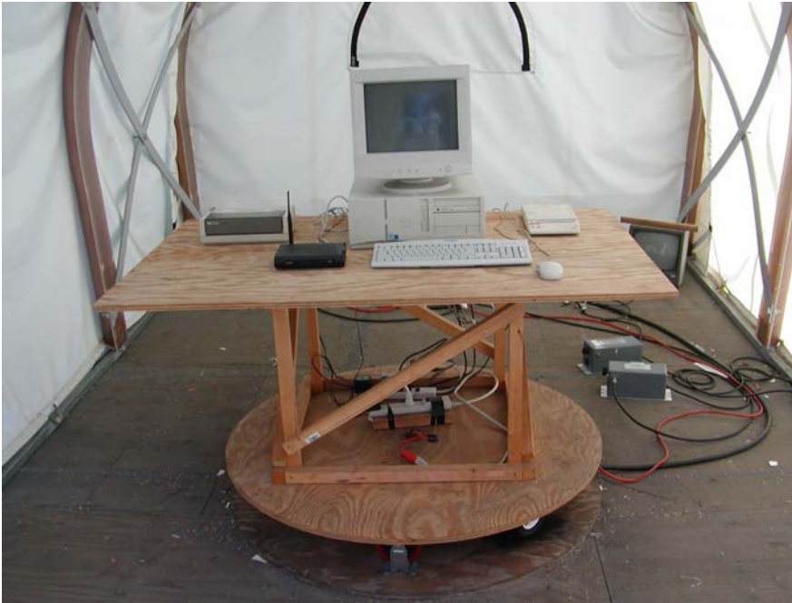
Radiated Emission - Rear View