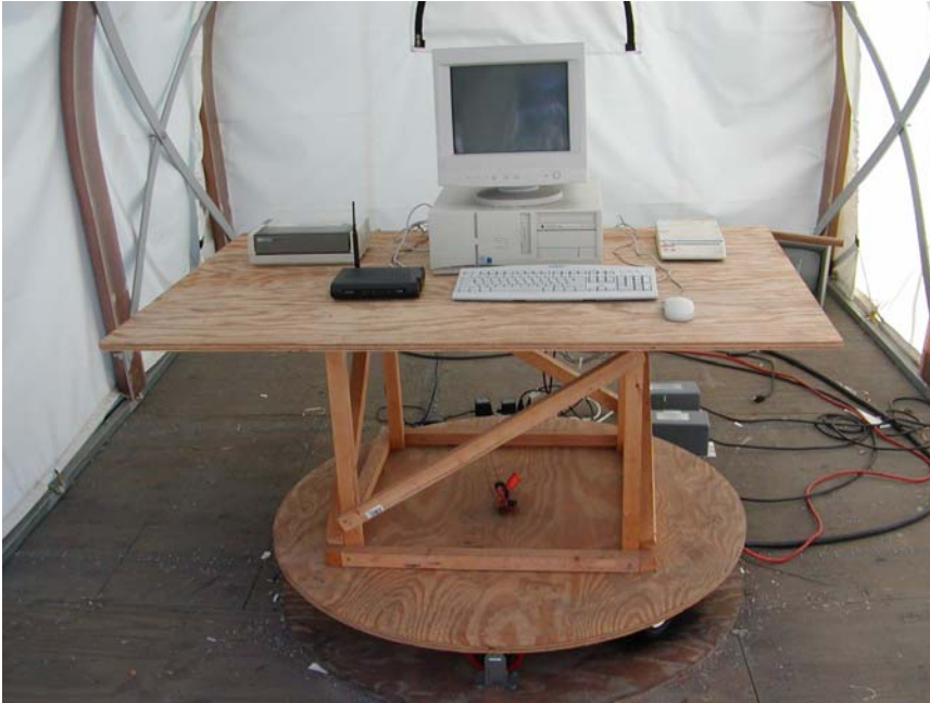
Conducted Emission - Rear View