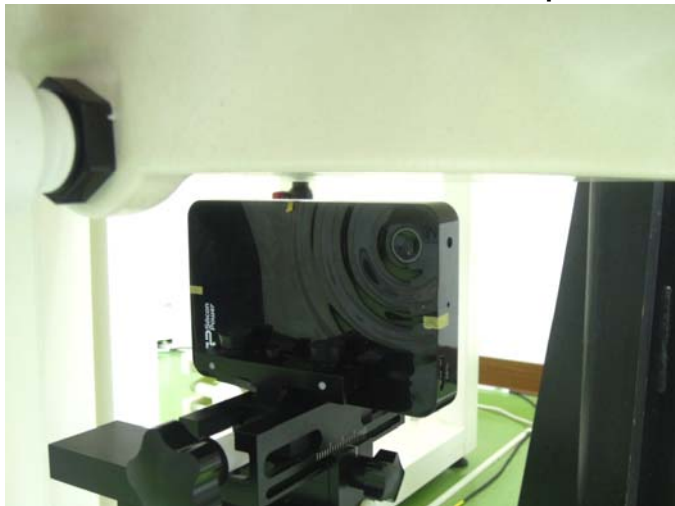
Right side of EUT with 0.5 cm Gap