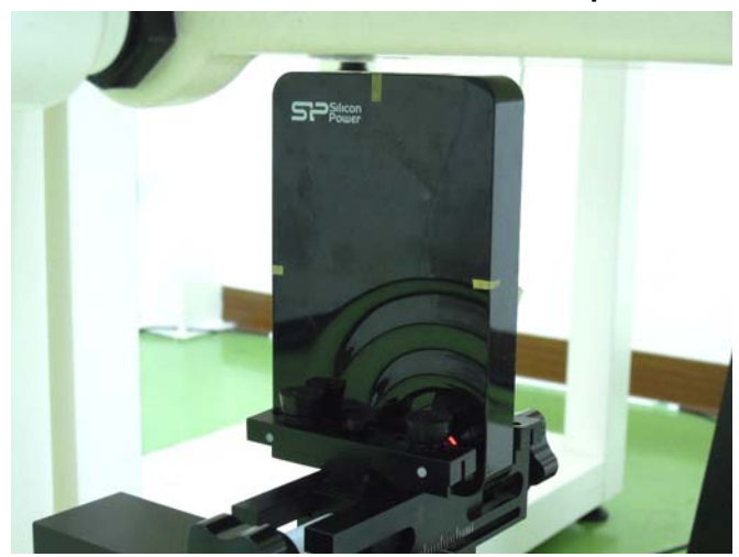
Top side of EUT with 0.5 cm Gap