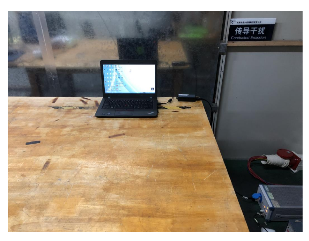
Test photo Conducted Emissions