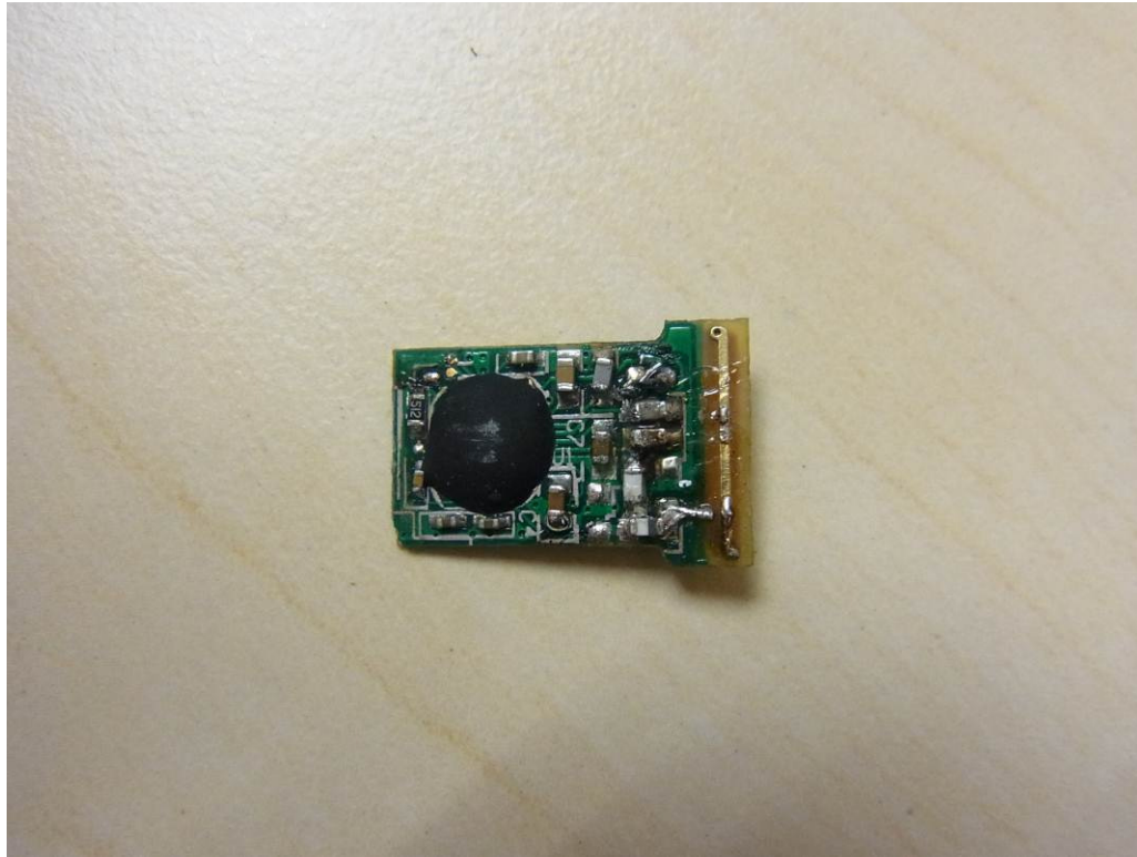
Fig. 1: Internal view

Type Designation: BYRX1 Report Number: 17030505 001