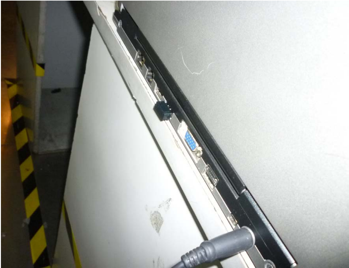
7.2.Photos of Radiated Emission Test (30-1000MHz)