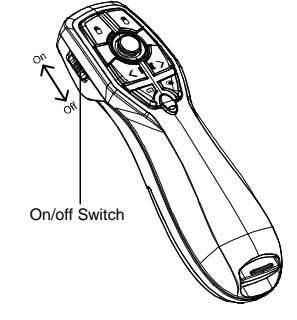
*Power switch on the presenter