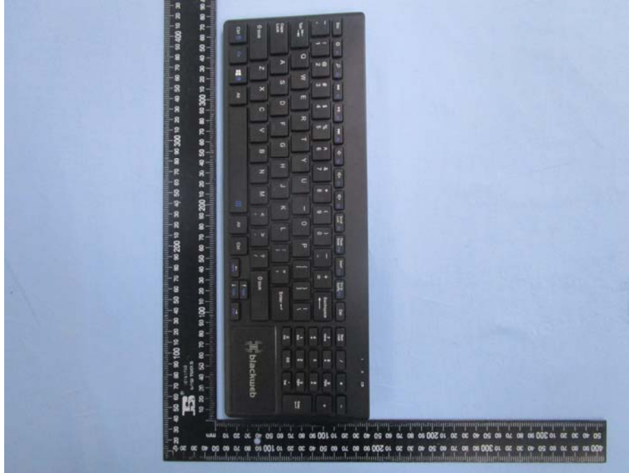
EUT View 2