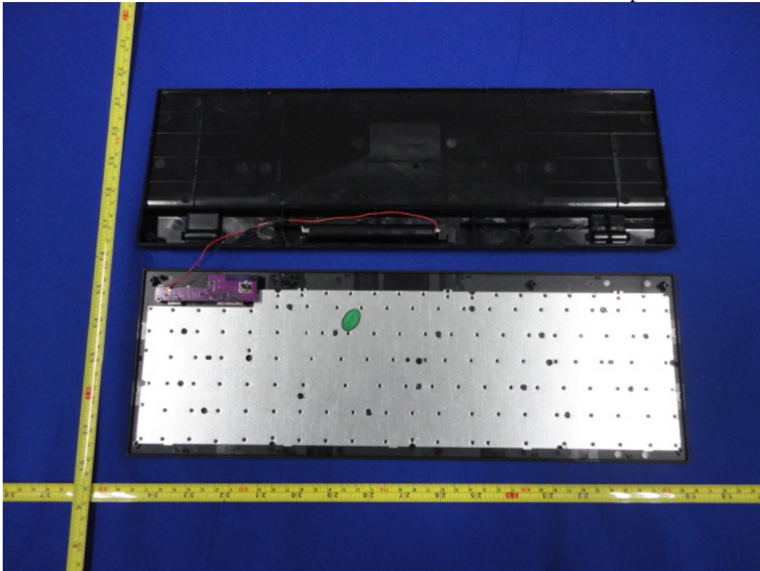
Figure 3 Component Side of the PCB