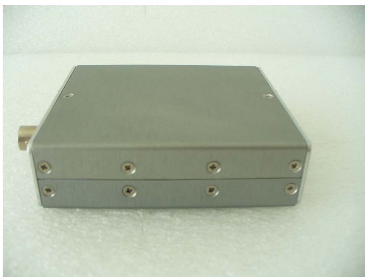
Figure 5: Left Side View