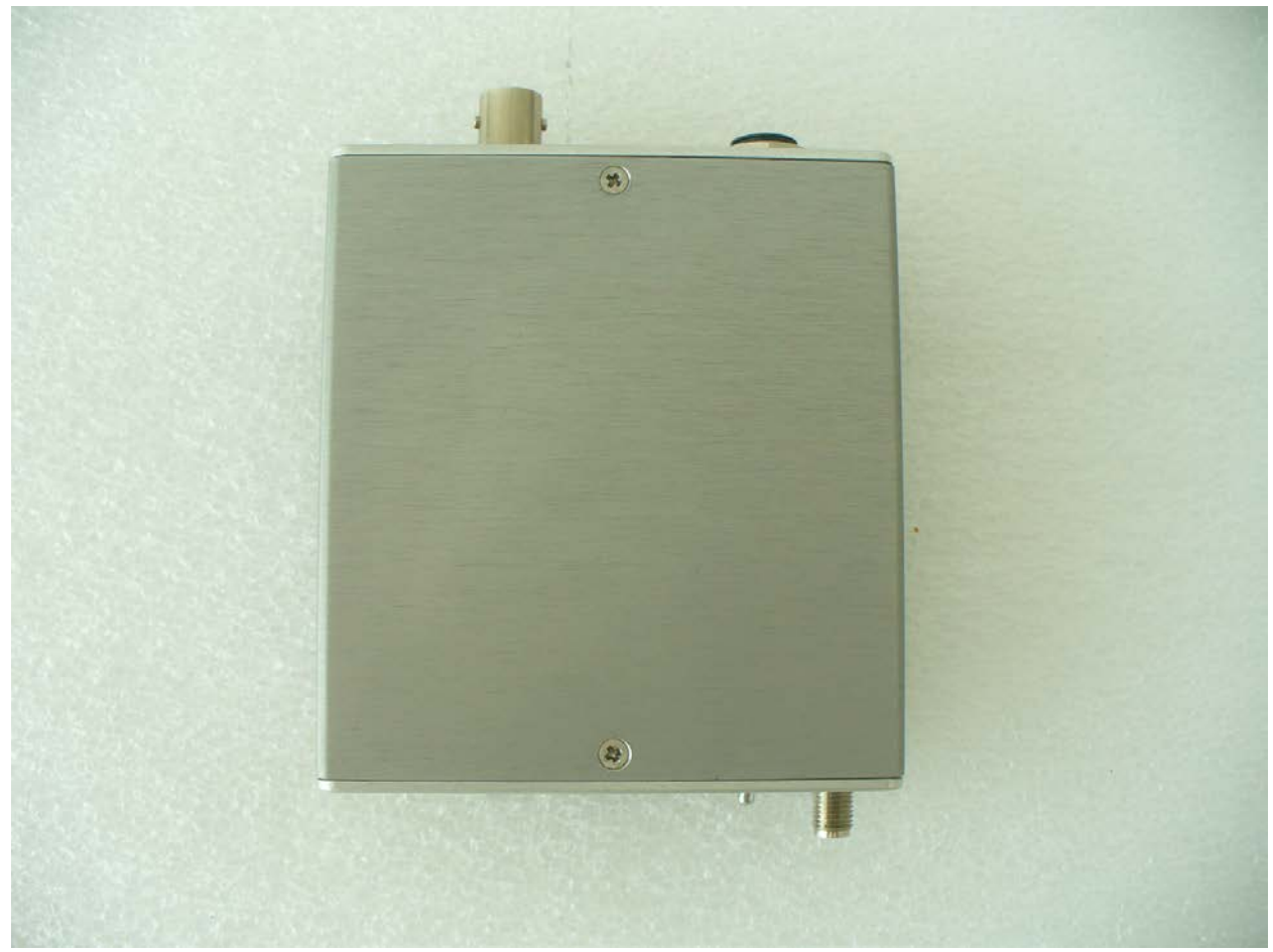
Figure 3: Top View