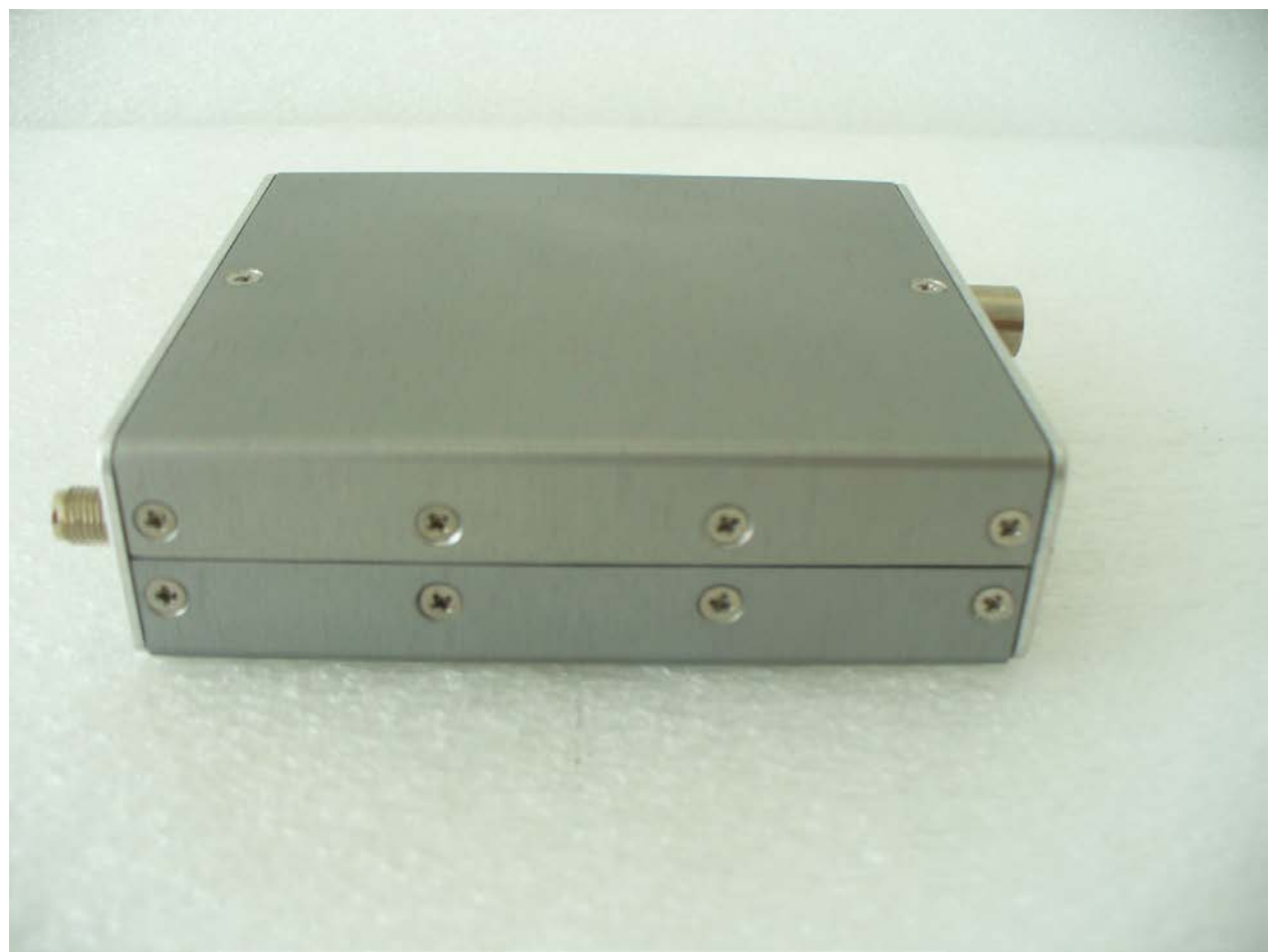
Figure 6: Right Side View