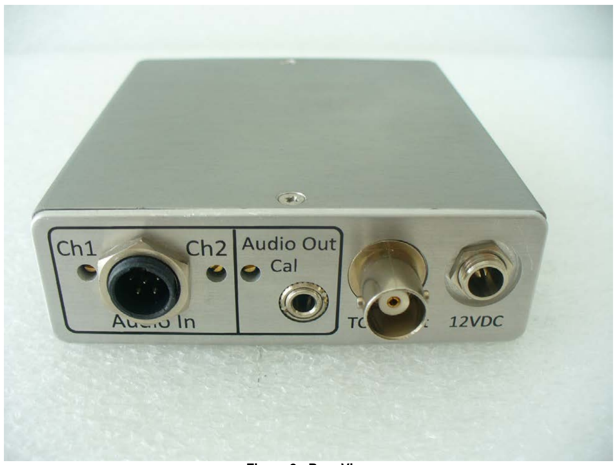
Figure 2: Rear View