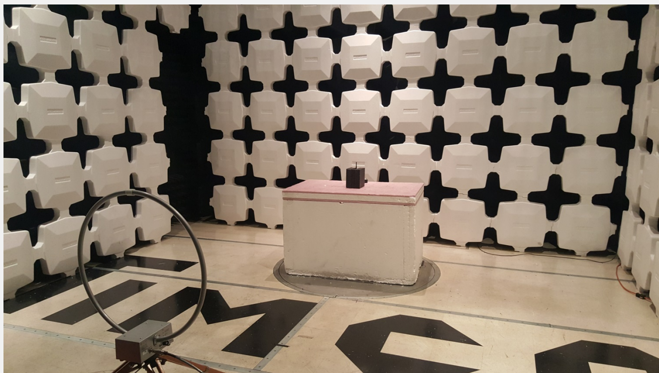
Radiated Emissions Scan 9 kHz to 30 MHz (Active Loop Antenna)