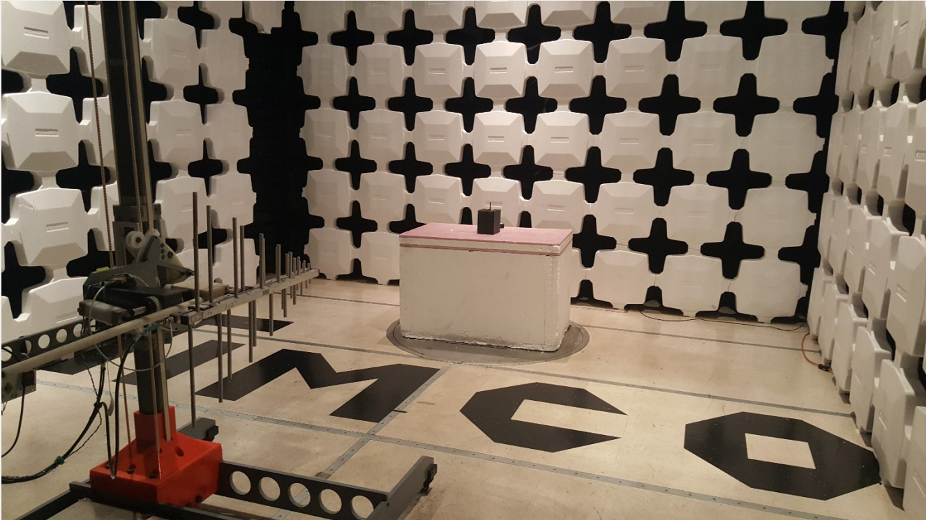
Radiated Emissions Scan 200 MHz to 1 GHz (Log-Periodic Antenna)