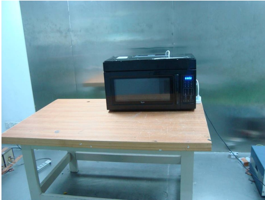
Conduction Emissions - Side View