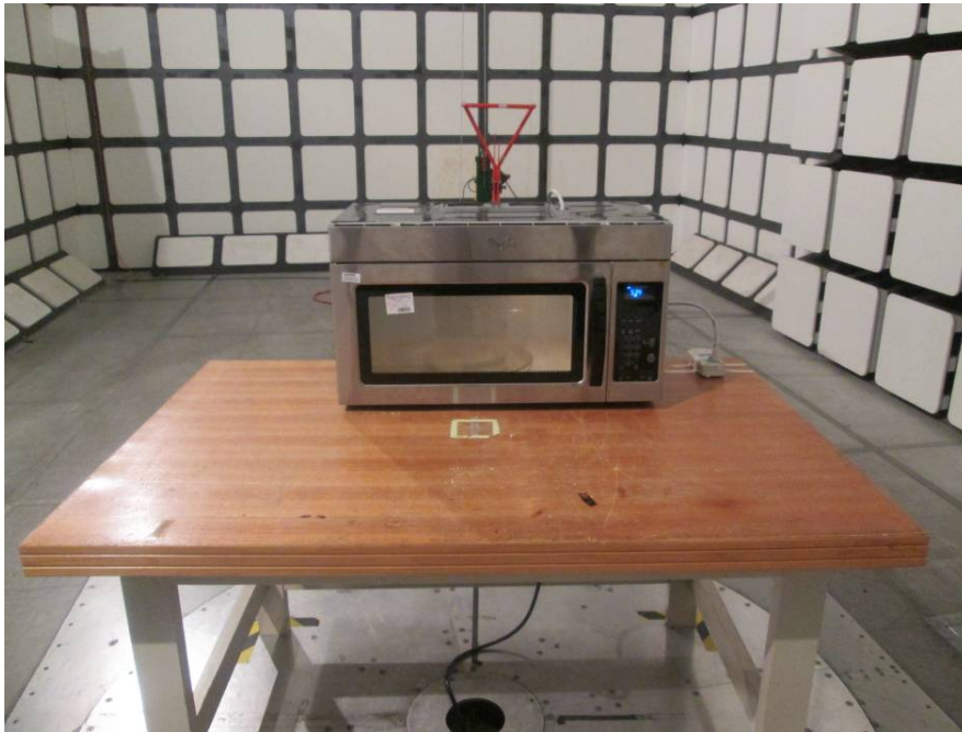
Radiated Emissions - Rear View (30 MHz – 1 GHz)