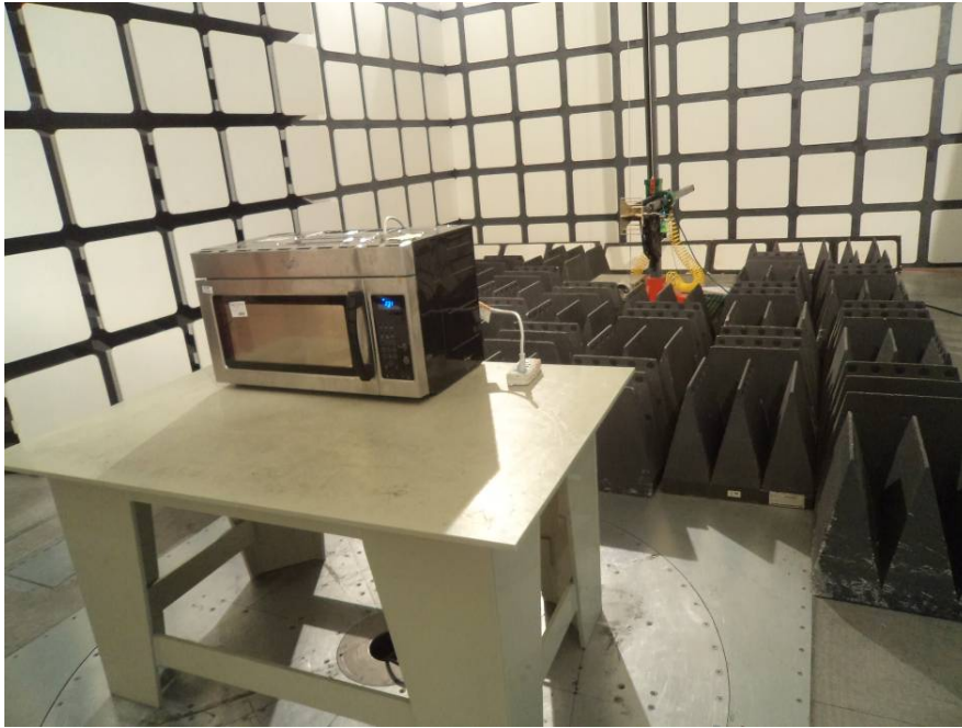
Radiated Emissions - Rear View (Above 1 GHz)