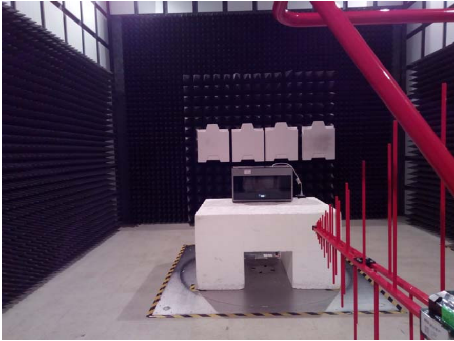
Radiated Emissions – Rear View (30 MHz – 1 GHz)