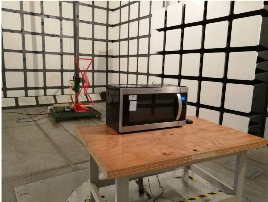
Radiated Emissions - Rear View (30 MHz – 1 GHz)