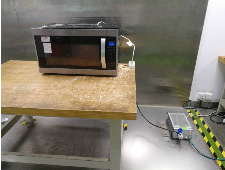
Conducted Emissions - Side View